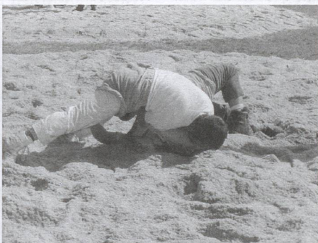
Both shoulders in the sawdust yet?

ter of 12 meters that is covered with sawdust. The two opponents wear short pants made of drill over their clothes. The wrestlers hold each other by these pants, at the back where the belt meets, and try to throw the opponent onto his back. There are several main throws, with names like "kurz", "übersprung" and "wyberhaagge", some of them very similar to judo techniques - "hüfter" is almost identical to koshi guruma, "brienzer" is basically uchimata. These throws are found in many wrestling systems that have even the slightest emphasis on throwing the opponent, and can also be seen in shuaijiao. A match is won when the winner holds the opponent's pants with at least one hand and both the opponent's shoulders touch the ground. By tradition the winner brushes the saw dust off the loser's back after the match.