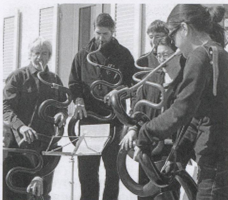
A slither of serpent players

Two serpentine halves had to be cut out of precious walnut planks, and hollowed out to the proper thickness. These were then glued together before being carefully whittled down to a smooth roundness.