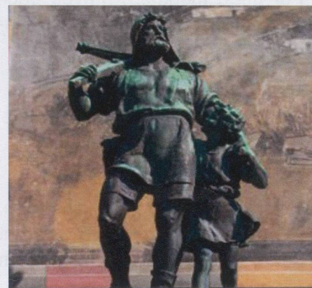
William Tell and his son Walter

Determined to see his task through and use the second arrow, Tell hurried to Kuessnacht. As Gessler and his party walked along on a dark lane called Hohlegasse on their way to the castle, Tell leapt out, shot a bolt into the tyrant's heart and melted back into the woods to return to Uri. His comrades were inspired by Tell's act of bravery to throw off the yoke of Habsburg oppression in their homeland, and to remain forever free.