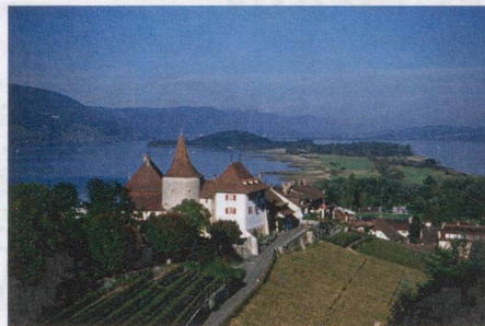
St Peters Island with Erlach in the foreground

As is common among the clergy, a vineyard and farmlet were developed, including a stand of chestnut trees. The land was gifted to the Cluny monastery by King William III of Burgundy in 1107 and was administered by the local representatives. In 1484, the Pope closed the monastery due to financial and moral deficiencies – the few monks were given to the wine a bit in excess.