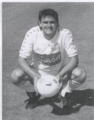
Wynton Rufer Oceania Football Player of the Century