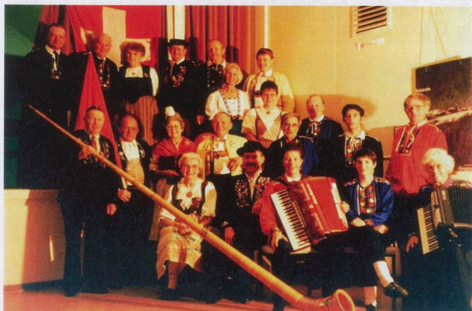
A musical celebration in Hamilton

The Club membership is steadily increasing and we now have 60 members. Meetings are held every third Sunday of each month at the Riverlea Cabaret, Hamilton, at 8 p.m. All Swiss resident in the Waikato, who are not yet members, are heartily invited to join the Club, where they will be most welcome. The life membership fee is £1, in addition to the annual subscription to the Swiss Society of New Zealand.