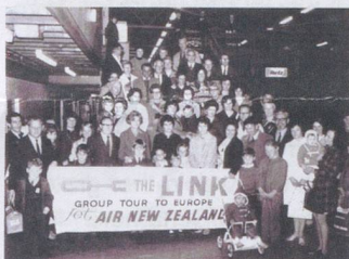
First group travel to Switzerland in 1964