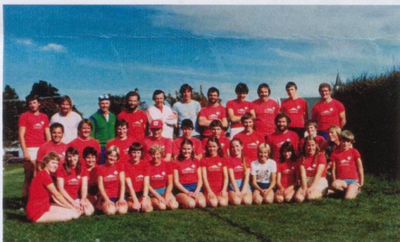
Soccer Tournament in Kaponga and "Top 10" competition

The Auckland Swiss Club was founded on Tuesday, 3rd November 1956. In January 1957, the first ever picnic was held together with the Waikato Club in the Bombay Hills. On that day, the first inter-club competitions were introduced, a tradition that has been kept up for almost 60 years now.