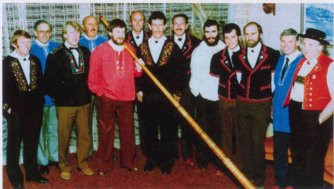
The handsome young men of the Auckland Swiss Kiwi Yodlers

The Auckland Swiss Club was founded on Tuesday, 3rd November 1956. In January 1957, the first ever picnic was held together with the Waikato Club in the Bombay Hills. On that day, the first inter-club competitions were introduced, a tradition that has been kept up for almost 60 years now.