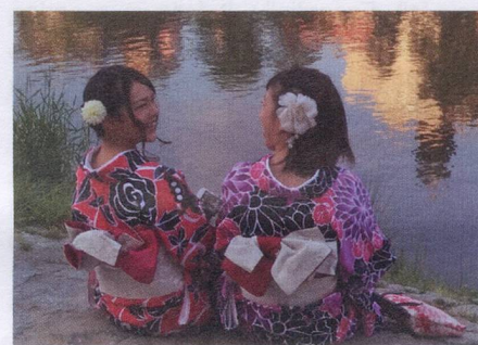
River with Kimono girls, Kyoto