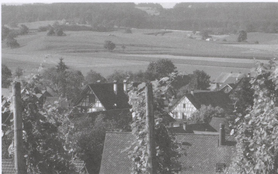
Zuercher Weinland Village Stammheim

The following is an interview by Trudi Fill-Weidmann with the co-owners of BEGE, a fusion of two Swiss farms. This enterprise is situated west of the Thurgau border, near the shores of the river Thur, in Niederwil, near Andelfingen, in a region named the Zuercher Weinland. Drops like Klosterberger, Schiiterberger, Ossinger and Stammheimer are wines that are grown in the area, mainly from the red Blauburgund or the white Riesling Sylvaner grape. The land is post glacial, flat, easy to cultivate and slightly sandy, which is beneficial to root crops like potatoes, carrot, beets and asparagus. The geological make-up of the area has been deemed well suited for the final storage of medium and high radioactive waste, according to scientific research carried out by NAGRA. Deep down. One day. Just by the way.