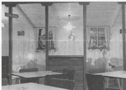
Swiss Chalet Restaurant seating