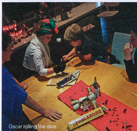
Oscar rolling the dice