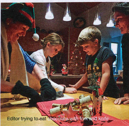
Editor trying to eat chocolate with fork and knife