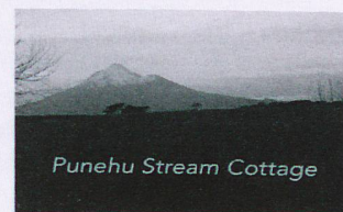
Punehu Stream Cottage

5 Milford Rd, Milford, Auckland • Phone 489-9737 find us on Facebook under Swiss Café and Bakery