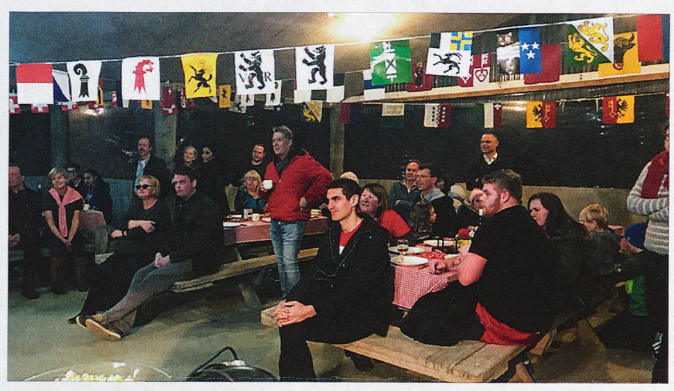
Auckland | Auckland members enjoyed a delicious fondue dinner at their party-ready Swiss Farm location.