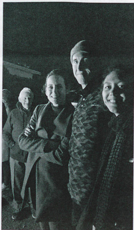
Wellington | Everyone enjoyed socialising by the 1st of August fire.