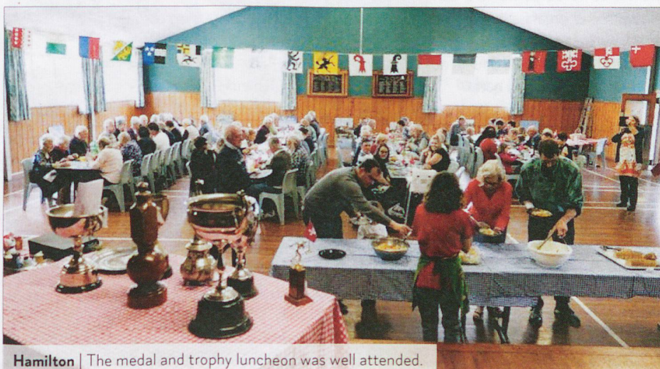
Hamilton | The medal and trophy luncheon was well attended.