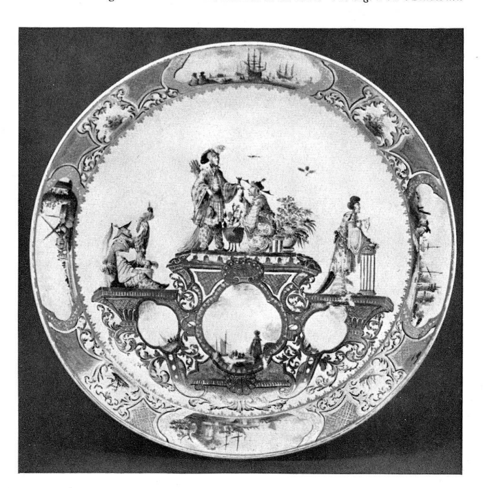
Fig. 45 Plate with chinoiserie figures by J. G. Herold and with harbor scenes both in color and in purple monochrome by Christian F. Herold. Mark: large swords. Meissen about 1730-35. Metropolitan Museum of Art, New York.