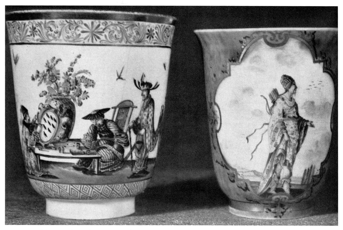
Fig. 37 Handleless cup with a combination of chinoiserie and armorial design painted by J. G. Herold. No mark. Meissen about 1723—1724. Slg. W. W. Blackburn.