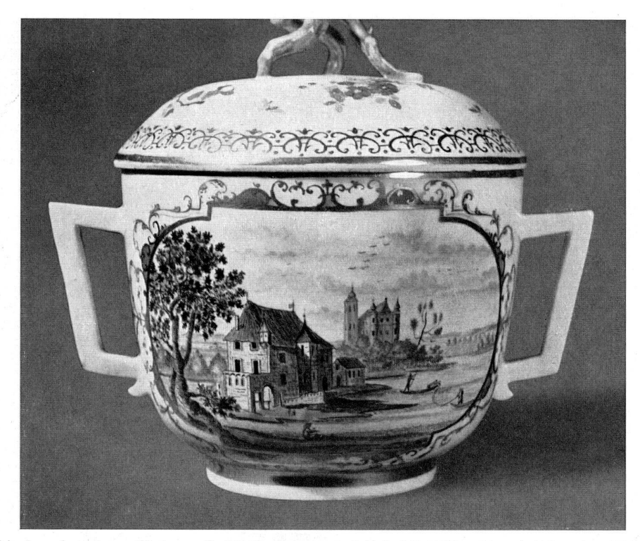
Fig. 41 Konfektdose with landscape decoration, possibly decorated by J.G. Herold, but more probably by J.G. Mehlhorn. Nomark. Meissen about 1722-23. Slg. W.W. Blackburn.