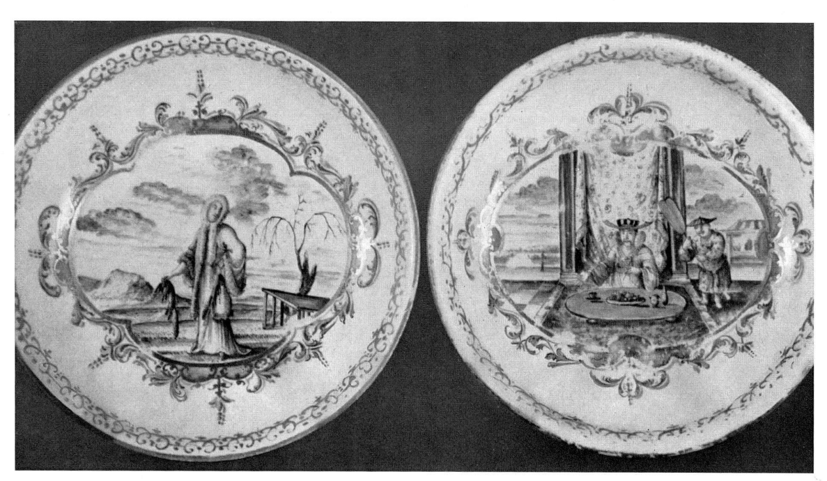
Fig. 39 and 40 Saucers with chinoiserie figures; sky has black clouds. Both painted by J.G. Herold after recorded J.G. Herold sketches. No mark. Meissen about 1725. Slg. W. W. Blackburn.