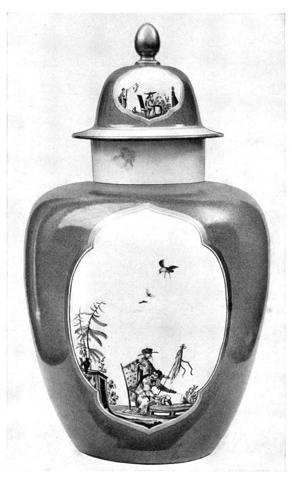
Fig. 43 Vase with green ground and chinoiserie panels painted by J.G. Herold. Mark: AR. Meissen about 1730. Metropolitan Museum of Art, New York.