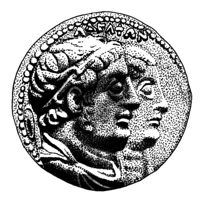
Fig. 2. Ptolemy II (reign: 282–246 BC) and wife Arsinoë. From Gisela M. A. Richter, The Portraits of the Greeks III (London 1965) fig. 1781.

The garden and outbuildings of the royal palaces<sup>34</sup> housed the collection of animals in what may be identified as one of the earliest known menageries<sup>35</sup> and, by all accounts, the most celebrated of the ancient ones<sup>36</sup>. Different in organization and aims from the Egyptian sacred enclosures<sup>37</sup> and from the Assyrian game parks<sup>38</sup>, it was an archetype of later zoos in much the same way as the Ptolemies' library was for book collections<sup>39</sup>. Ptolemy II's animals were exhibited to the general public on special occasions such as the whole day procession (\pi o \mu \pi \dot{\eta}) of the second Ptolemaieia (\Pi \tau o \lambda \epsilon \mu \alpha i \epsilon \iota \alpha) , which took place at a date still open to discussion, some time between 280/79 and 271/70<sup>40</sup>, and also displayed to foreign visitors as an outward sign of power and prestige<sup>41</sup>.