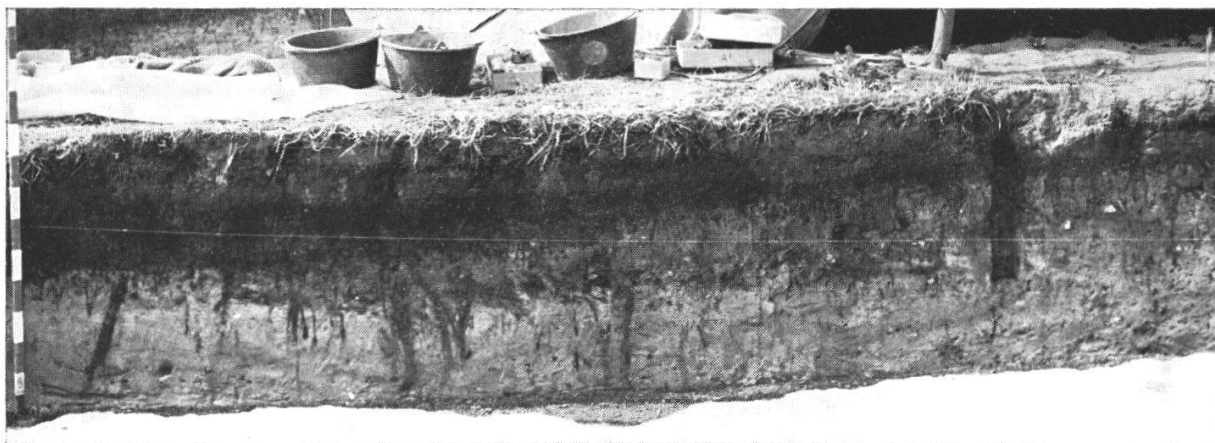
Fig. 2 Photo of Profile showing Ice Wedges

The wedge-shaped features in the profile are ice-wedge pseudomorphs ( Pseudo-eiskeile ), shown in Fig. 1 and 2. Ice wedges are formed only under conditions of