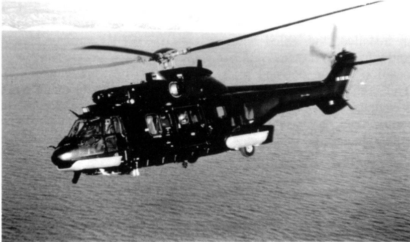
Versatile par excellence, the AS 532 U2 offers a large cabine. Its extended range and its integrated navigation systems make it a SAR and combat/SAR helicopter perfectly suited for today's requirements (day/night missions).

ween the downed pilot and his allied forces. If the time management procedure is correctly followed by the downed pilot, it enables also an authentication of the sender. If anybody is able to transmit a distress message, including foes, not anybody knows when and during how long time he is supposed to transmit.