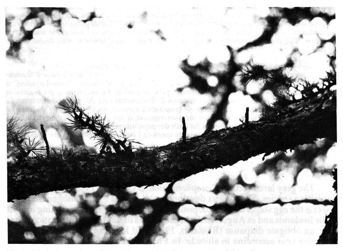
Fig. 1: Distribution of the sticks with eggs of Z. diniana on a larch branch.

the host and the existing mass rearing techniques for Trichogramma , the parasitoid was selected for utilization in mass release operations. In 1969 preliminary studies on the dispersal of the parasitoid were initiated in the Upper Engadine Valley. It appeared, however, that many exposed eggs were destroyed by predators during the summer months and that the action of the parasitoid might be nullified by the interference of predators. The role of predators in limiting Z. diniana populations in the egg stage was therefore studied during the three subsequent years, 1970–1972, in three localities – Zuoz and Madulain, 1800 m a. s. l., in the Upper Engadine Valley, and Lenzburg, 550 m a. s. l., about 30 km west of Zürich. In the experimental area at Zuoz visible damage occurs at every gradation of Z. diniana , in that of Madulain visible damage does not occur or is very limited (Dr. C. Auer, pers. comm. ).