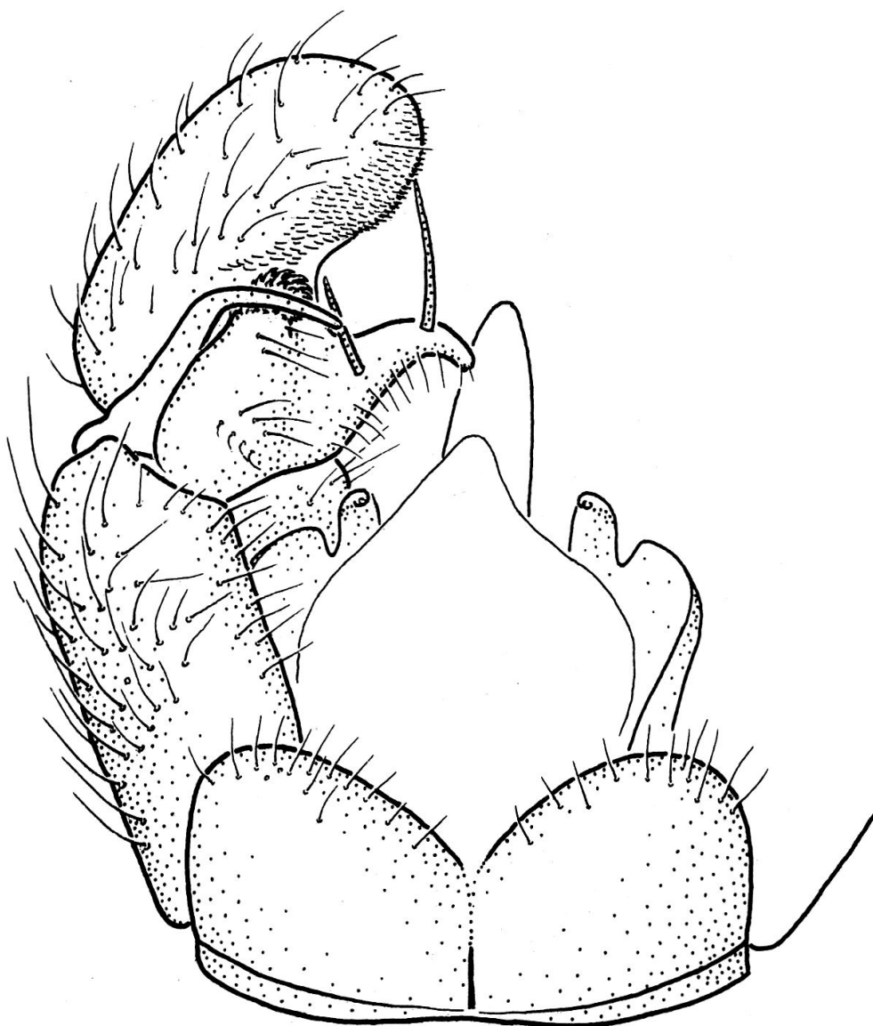
Fig. 3. D. melanantha SAV., genitalia in dorsal view.

the European Dicranomyia . However, it was afterwards detected in D. goritiensis , D. circassica and D. melanantha and might serve as a useful character at a higher level.