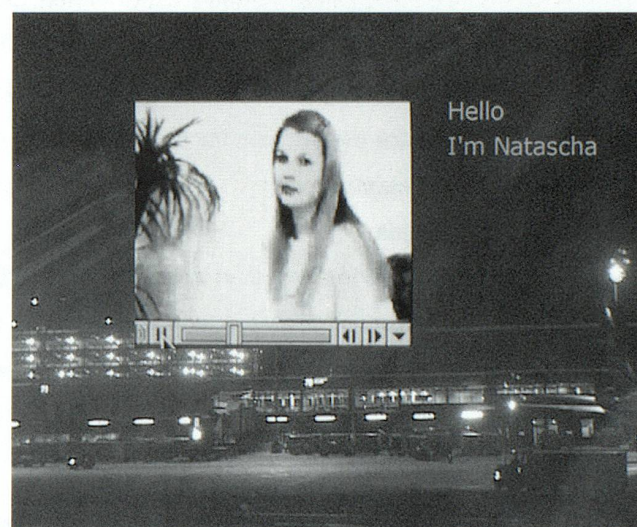
Ursula Biemann, still 3 from WRITING DESIRE