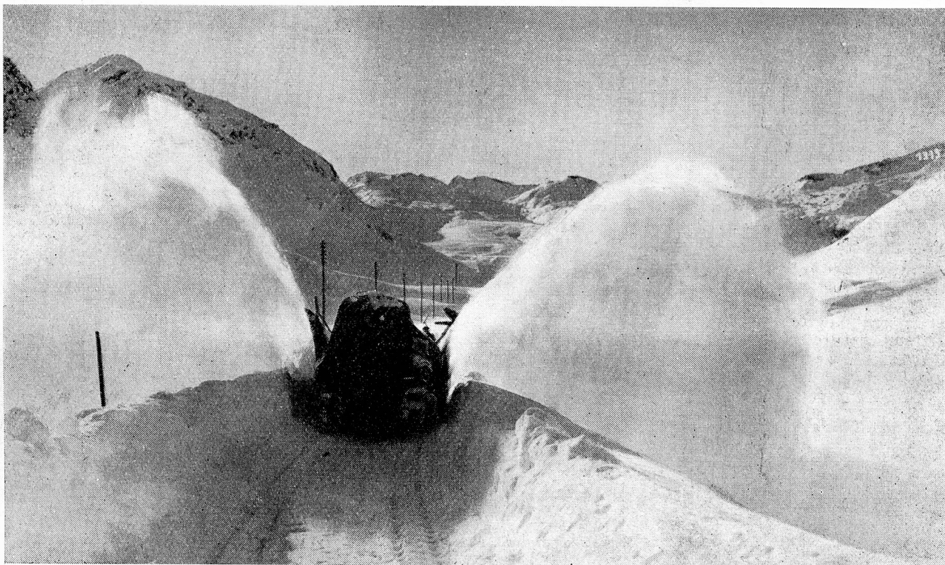
Clearing the Julier Pass by means of a Rotary Snow Plough of the Swiss General Post Office.

A heavy blizzard will reduce visibility to a few yards and cover signal lights in no time. Falls of snow to a depth of 5 to 6 feet in 12 hours are by no means uncommon. Strong winds either with, or following, a heavy fall often cause, especially in cuttings, an accumulation which takes heroic efforts to clear. All this may happen at comparatively low altitudes where there is little danger from avalanches. In the mountains, however, nature adds this new handicap. How real and terrible in its effect this can be was shown during the winter 1950/51 when an avalanche disaster of great magnitude overtook Switzerland, with grievous loss of life, extensive material damage and disorganisation of rail and road traffic. Avalanches are common in the alpine region. They are a natural phenomena there, but almost unknown in this Country. You will, therefore, perhaps allow me to give you a rough idea how they happen and behave. I should perhaps start by mentioning that snow varies a great deal in consistency, weight and texture. Freshly fallen dry powder snow weighs roughly 30 kilos per m 3 . Wet snow which generally falls in large flakes may weigh as much as