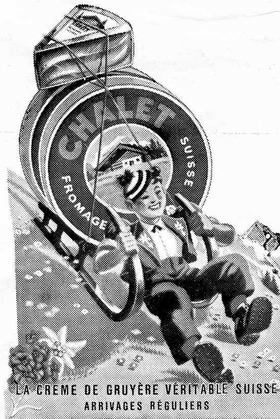
Famous all over the World for Quality and Tradition

The largest theatre in Switzerland, the Théâtre de Beaulieu, in Lausanne, was opened on November 19,