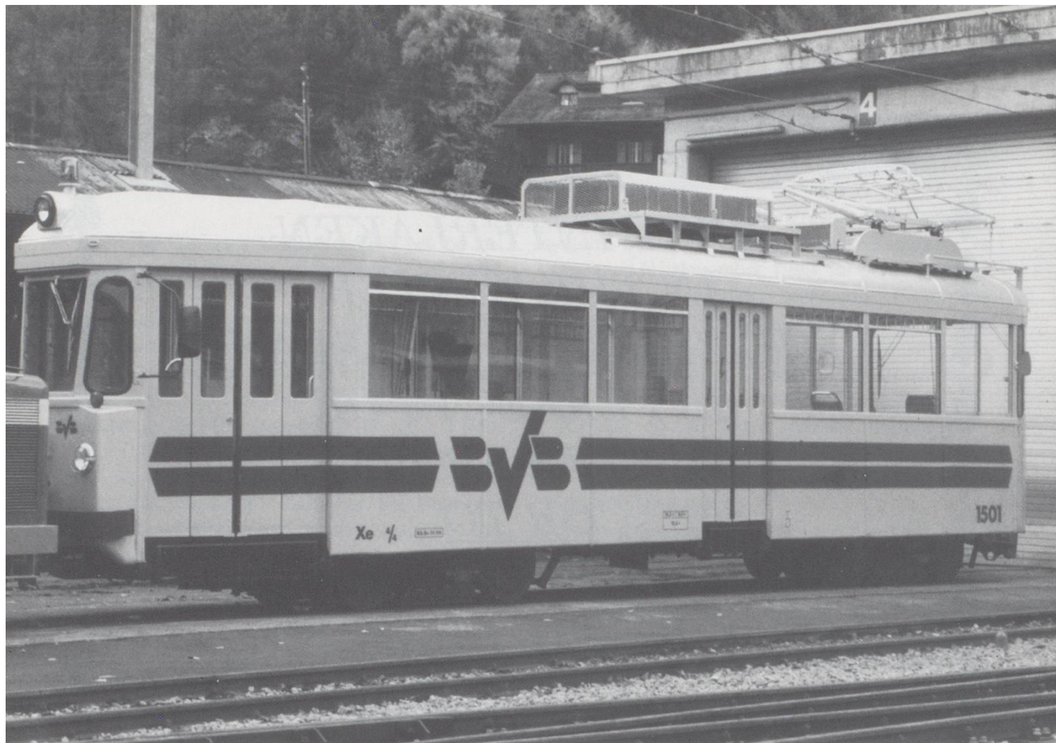
Above: Bex-Villars-Breiteye (BVB) Xe4/4 1501 seen here at the depot at Beviex in new livery a reversal of the normal red with yellow graphics, 30/10/98.

voltage locomotives (15kV AC / 3kV DC), similar to the recent FS E412 design, to work Huckepack services between Freiburg im Breisgau in Germany and Novara in Italy over the Lötschberg / Simplon axis.