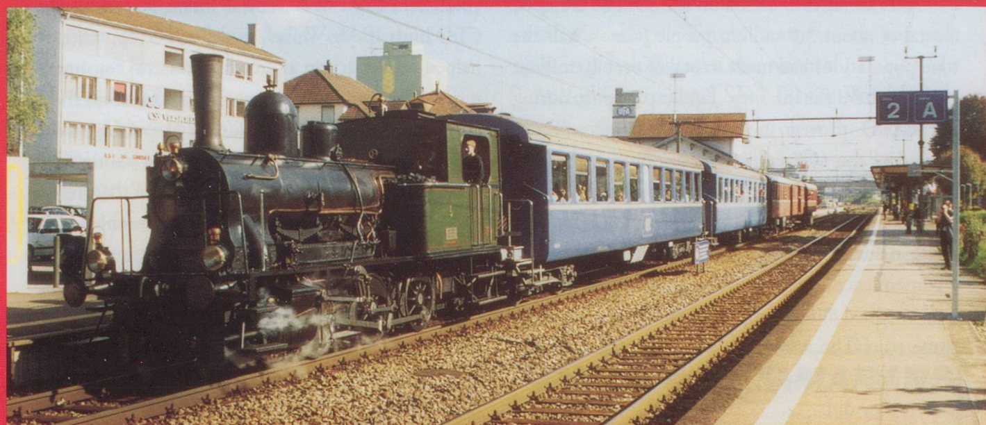
ABOVE: No. 5 heads off from Sursee on the Luzern - Basel main line to branch off to Triengen