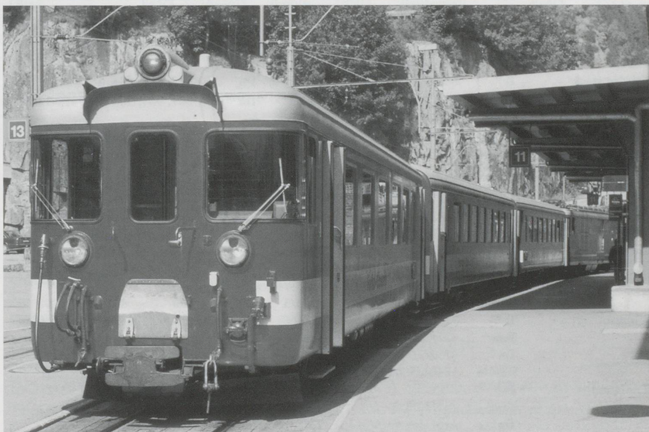
The Furka-Oberalp Göschenen-Andermatt train awaits departure at the former. Summer 1999

was no free path from Bern to Neuchâtel on this single line at this time in the morning (remember that the service it replaced ran via Bienne) a NINA-set is coupled onto the front of the existing NINA-service to Avenches. At Kerzers, it continues on to Neuchâtel on its own. This is exactly the kind of flexibility offered by the multiple unit running capability of these sets. Passengers are treated to a trolley service on this train: a first on this three car local service vehicle. Anybody buying a tea or coffee, gets a croissant offered free by the BLS! Your correspondent sampled the service on the first day of operation, the 29th of November, for which I had to leave Kandersteg at 0521 and I can confirm that about 70 people were on board. 20 hot drinks with croissants were sold. No doubt once the word gets around more will take up the offer!