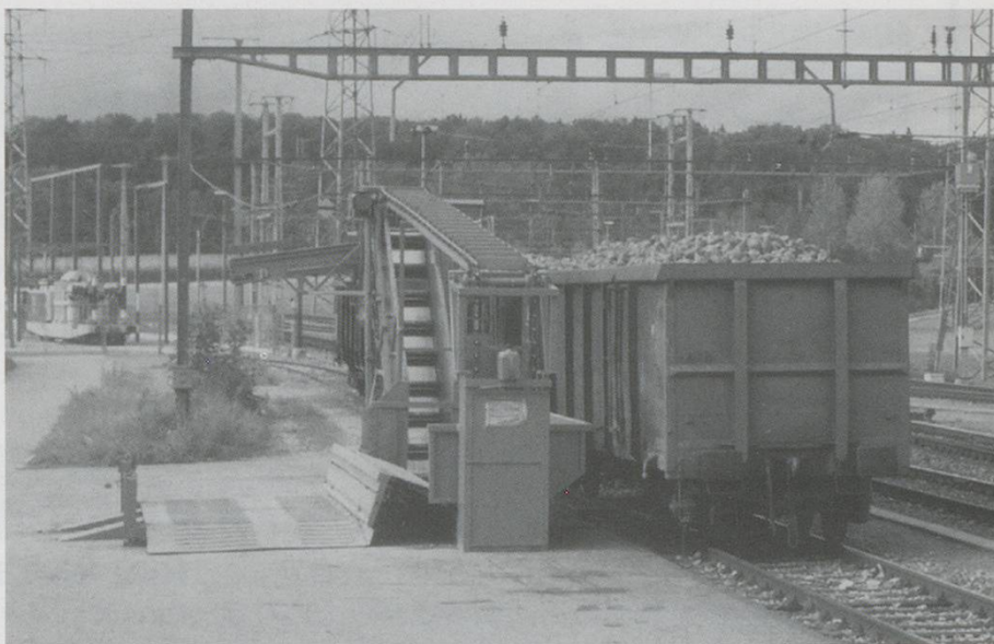
Two views of Hendschiken. The upper shows beet loading. In the background distance is the Zürich-Aarau line crossing the Brugg line. The latter (looking south) shows the station area, an Re6/6 and an Re4/4 travel light engine somewhere!