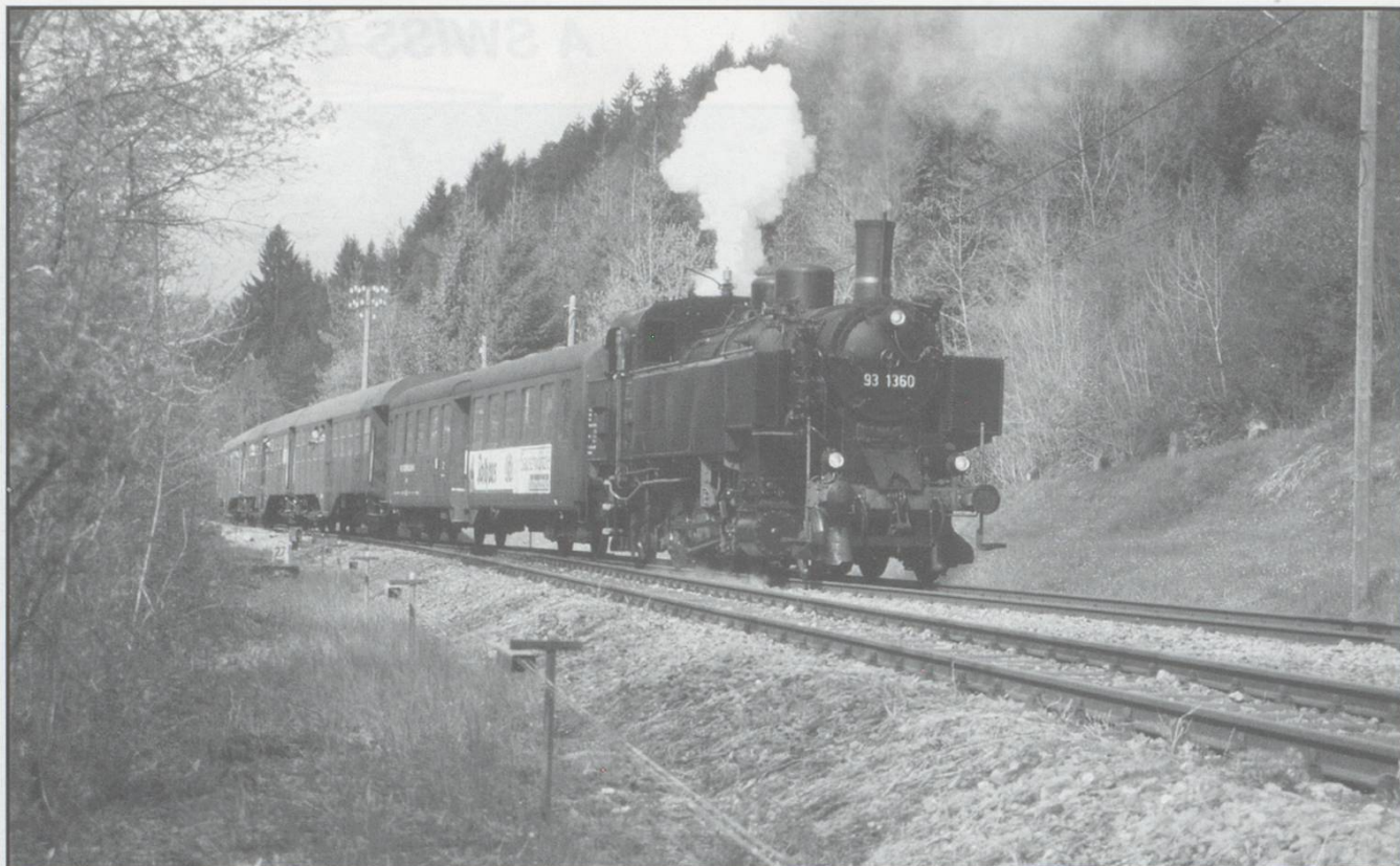
93 1360 during run past at Gummelshofen on the Wuchtalbahn.

speaker." Schaffhausen blood was clearly thicker than water!