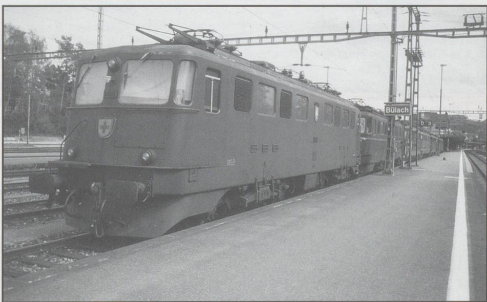
UPPER: 11153 at Schaffhausen MIDDLE: Bülach. From camera 11408/475/510 LOWER: Bülach. From camera 11506/415/488/442/510/475/408