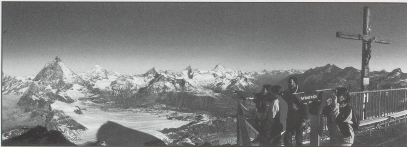
Observation platform at the Klein Matterhorn.