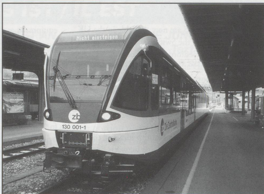
Some views of the new Zentralbahn corporate image.

The introduction of the Stadtbahn Zug services has not been without problems, so much so that SBB and ZBB had to issue a public apology on 2 nd February! A number of causes have been identified; these include an ambitious schedule in an already busy area, propagation of delays caused by the single track section between Cham and Rotkreuz, and a shortage of rolling stock, not helped by there being only 4 FLIRT units in service out of the planned 11. Adding to the difficulties, the FLIRT units have yet to be authorised for multiple operation, the first trials in passenger service being planned for mid-January but do depend on there being enough serviceable units. Due to heavy loadings on the S1 service from Luzern to Baar arriving Zug at 07:20, a relief S-Bahn service has been provided on Mondays to Fridays for the 8 minute journey from Cham to Zug, leaving Cham just ahead of the S1 service, which couldn't be strengthened because the FLIRT units could only work singly. The FLIRT multiple working trials were scheduled for a peak hour (morning outward, afternoon return) working from Luzern to Zug, the morning working being timed