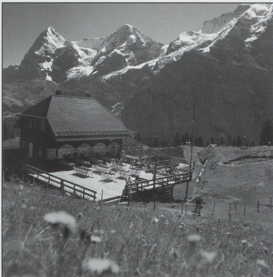
ABOVE: Mountain restaurant Allmendhubel (1907 m) above Mürren in the Bernese Oberland. The majestic peaks of Eiger, Mönch and Jungfrau loom in the back.

We have long wanted to walk from Schynige Platte to Grindelwald First but have always been thwarted by snow. However, if one starts at Grindelwald and uses the gondelbahn (I wish they had kept the chairlift) to First one can do parts of it in comfort. From First there are many options for wonderful walks.