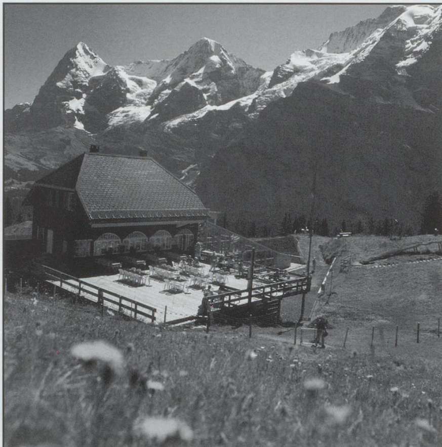
ABOVE: Mountain restaurant Allmendhubel (1907 m) above Mürren in the Bernese Oberland. The majestic peaks of Eiger, Mönch and Jungfrau loom in the back.

We have long wanted to walk from Schynige Platte to Grindelwald First but have always been thwarted by snow. However, if one starts at Grindelwald and uses the gondelbahn (I wish they had kept the chairlift) to First one can do parts of it in comfort. From First there are many options for wonderful walks.