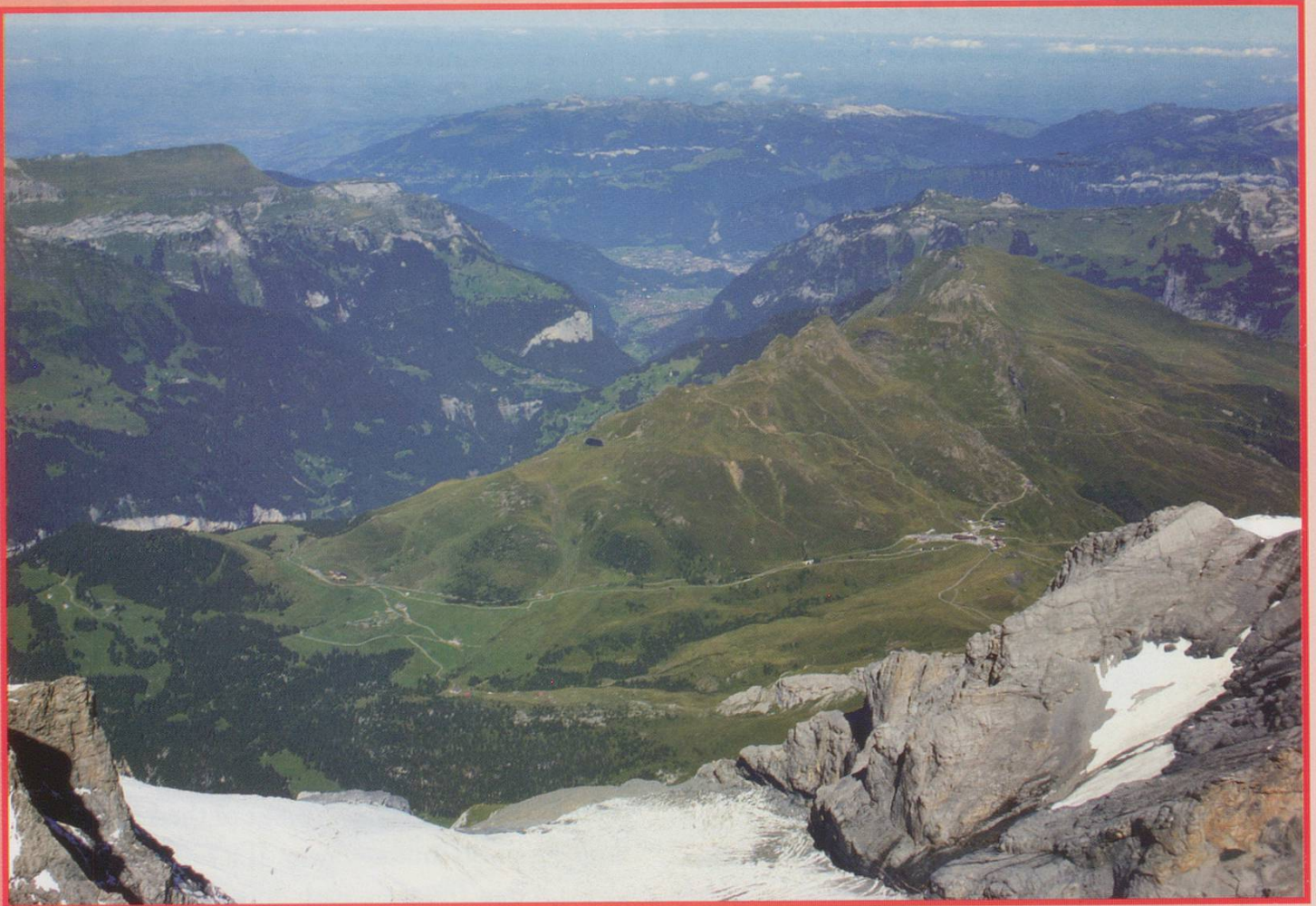
ABOVE: The view from the top. Taken from the Sphinx. 01.09.04