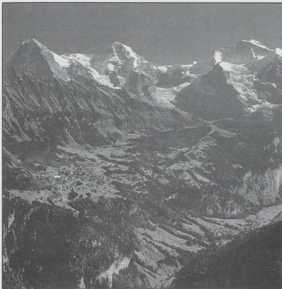
Isenfluh (1084 m) in the Bernese Oberland. View from Sulwald above the village onto Eiger, Mönch and Jungfrau mountains. To the left, the resort of Wengen, in the valley below the resort of Lauterbrunnen.