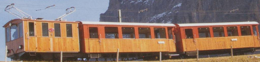
Jungfrau's "Rowanzug" makes its farewell run from Kleinen Scheidegg to Eigergletcher and back.