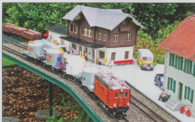
View of cement train on track 2 passing through St. Niklaus yard in the direction of Zermatt.