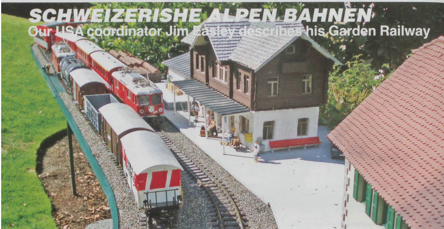
View of entrance to St. Niklaus Station. Goods train on track 2 waiting arrival of Glacier Express.

Our USA coordinator Jim Easley describes his Garden Railway