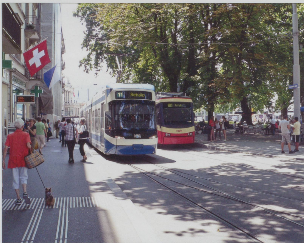
TOP LEFT: Tram and train on same line at Kreuzplatz.