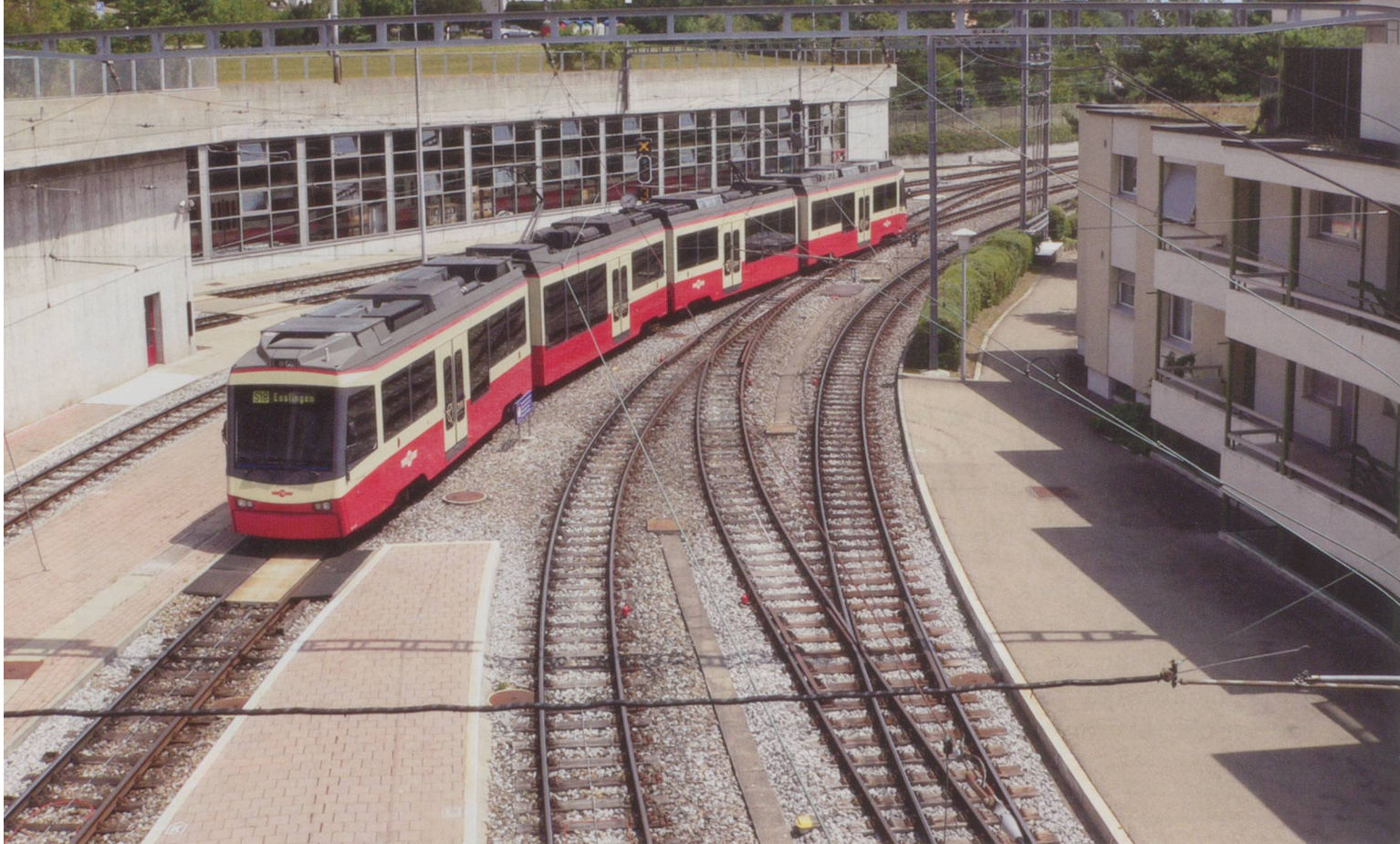
Train departing Forch for Esslingen.