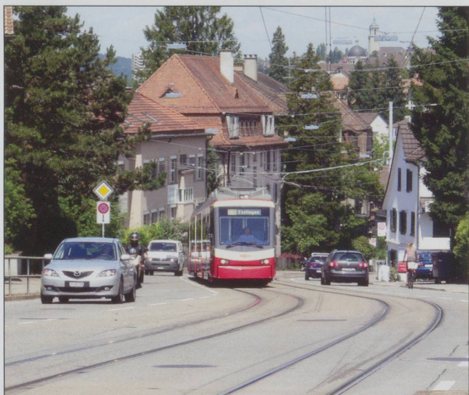
BOTTOM RIGHT: Train passing the Gemeinde Kirch at Balgrist.