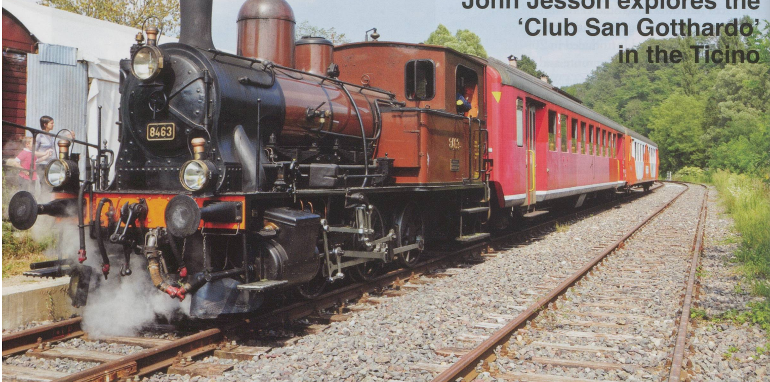
Ex.SBB E3/3 No. 8463 just arrived at Malnate.