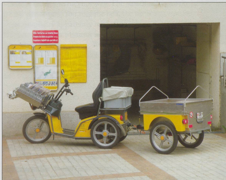
BELOW: The smallest post vehicle in Val Mustair.