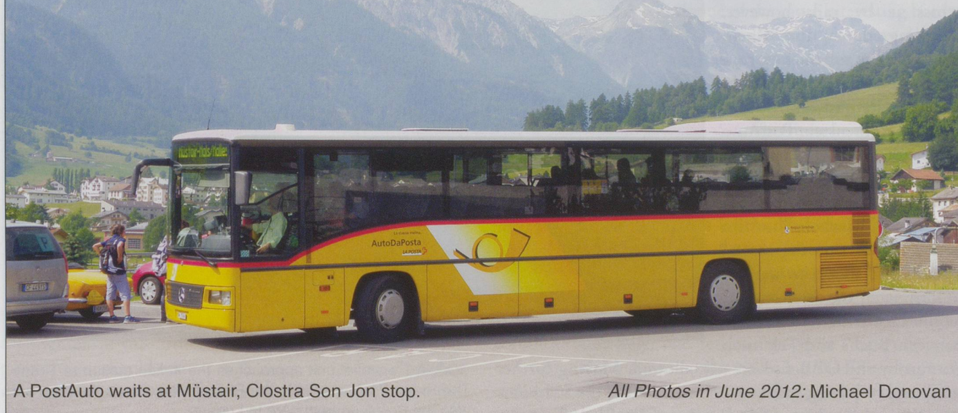
A PostAuto waits at Müstair, Clostra Son Jon stop.