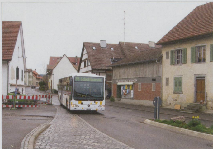
A Schaffhausen bus in Busingen, Germany, in April 2012.