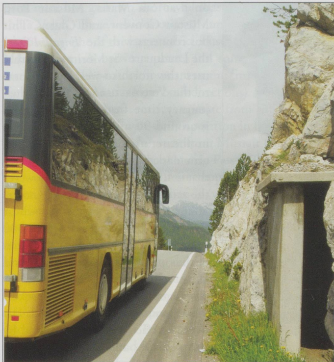
A Setra PostAuto leaves the Ofenpass for Zernez.

The journey starts at the station at Zernez (1471m) that has recently been completely rebuilt with trains usually using Platform 1. All the PostAuto routes now operate from immediately adjacent to the top of the ramp from the (almost unused) island platform, with shelter between the train and the bus. Leaving Zernez, passing the National Park Centre, the bus heads for the Ofenpass and the entrance to the Park, climbing rapidly up onto the side of the valley. There are many curves and retaining walls, some avalanche shelters or tunnels, and spectacular views of the surrounding mountains. There always seems to be two pieces of work, resurfacing or rebuilding structures, taking place on this section, usually involving traffic light control. This is allowed for within the schedules. Entering the National Park, the first major stop is Punt la Drossa, where the route to Livigno turns off, whilst the next stop is the only place in the park where visitors are allowed to spend the night – Il Fuorn. The road exits the Park at Buffalora, and then continues to climb at a steady grade, with far more gentle curvature, to the top of the Ofenpass (2149m) where there is a hotel/restaurant. Then there is a very steep drop, around some extremely tight reverse curves, sometimes requiring the use of the post horn to warn of the bus's need to occupy the whole road while making the turns!