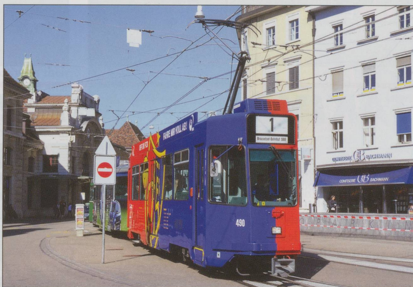
BVB Class Be 4/4 single car No. 490 was at the head of this Route 1 service recorded arriving at Bahnhof SBB.

Despite the infiltration of new Stadler units there is still a great variety of more traditional Swiss Standard combinations to be seen and enjoyed, as has been well documented previously in the pages of Swiss Express . Added to this, there were a number of units carrying non-standard liveries supporting advertising branding to be seen. While the purists may well frown on such practices, it gave me the opportunity to capture a selection of colour variations that provide a sample of what could be seen on the Basel network at the time of my visit. With a sizeable order placed with Bombardier for more new trams, the opportunity was not to be missed as I