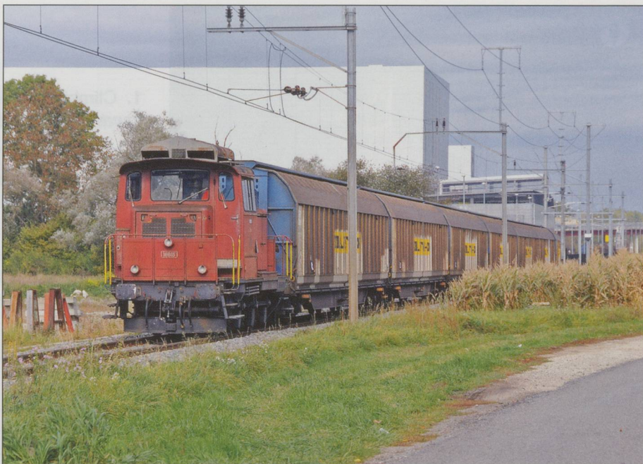
TOP: On a dull, wet Sunday in October 2012, SBB Cargo Re4/4" 11258 heads north through Neuchâtel with the Chavornay to Avenches Nespresso vans.