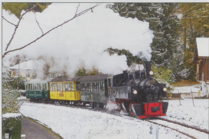
BC No 105 pulls its train through the snow.

in 'Golden Mountain Pullman Express' sets from Vevey to Blonay. Following this, October 27th/28th was the last weekend of the season on the B-C. This is later than on other museum lines due to the normally gentle warm autumn days on the south-facing slopes above Le Léman. However last year, after a glorious autumn week, there was an 'unheard of for that region' heavy snow fall. This snow blanketed the whole country as overnight temperatures dropped below zero. B-Cs G3/3 No.6 and its companion No.105 were out and about in these unusual climatic conditions, resulting in a bonanza for photographers who were able to take some splendid 'Christmas Card' shots. On the main line railways the unexpected snow resulted in no serious incidents but some minor delays. However on the roads some passes were closed and there were numerous, fortunately minor, crashes that caused long delays. Members may not know that it is usual in Switzerland to fit snow tyres (adapted for low temperatures and with a special tread profile) to cars for the winter, but at the end of October few had yet done so.