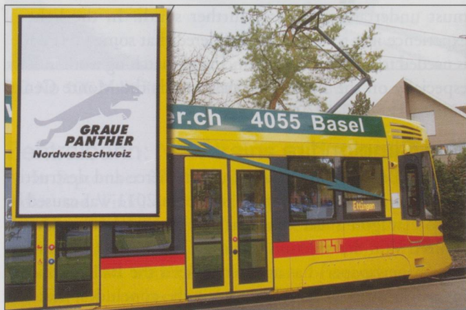
BLT's new "Grey Panther" tram

BLT's recently delivered new TANGO trams (Nos. 151-169) have all been named - with the usual Swiss ceremony of speeches, a village band in attendance, an Apéro and much public enthusiasm. All except one had received the names of Communes, both large and small, along Lines 10 and 11 where they will operate. One however, delights the Swiss News Editor, long a pensioner. Tram No.168 is named 'Graue Panthers, Nordwestschweiz' ('Grey Panthers Northwest Switzerland') after the independent organization which looks after pensioners' interests and wellbeing, both socially and politically. Years ago 'proper' engines carried good solid names all their lives, so let us hope that this TANGO will recognise and serve, this growing group of citizens for a long time. Stadler has designed and built these trams with serious thought to needs of the elderly, a compromise inevitably with their commuter vocation.