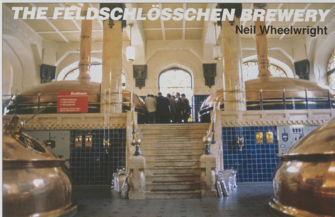
A couple of the twelve brewing vats.