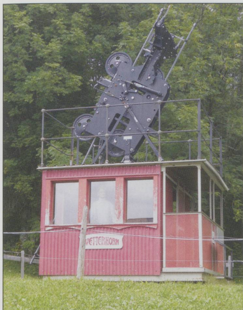
LEFT: The remains of the old steps to the glacier. ABOVE: An original Wetterhorn cable car with a forlorn passenger.