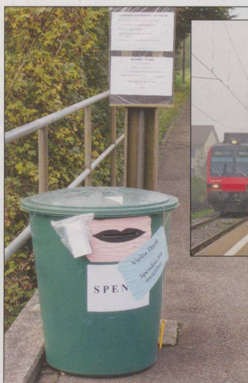
The local appeal bin, notice and out of service clock..

During last summer the SBB platform clock ceased to function. After a few days, a member of SBB Infrastructure came along, climbed up his ladder, and covered the clock with a plastic bin bag. Expectations were high that with usual Swiss efficiency, a replacement clock would soon be provided. Weeks went past and nothing happened. Several passengers enquired of the SBB as to what was happening. No one at SBB seemed to know exactly why the clock was not being repaired or replaced. It was claimed that it was not a financial