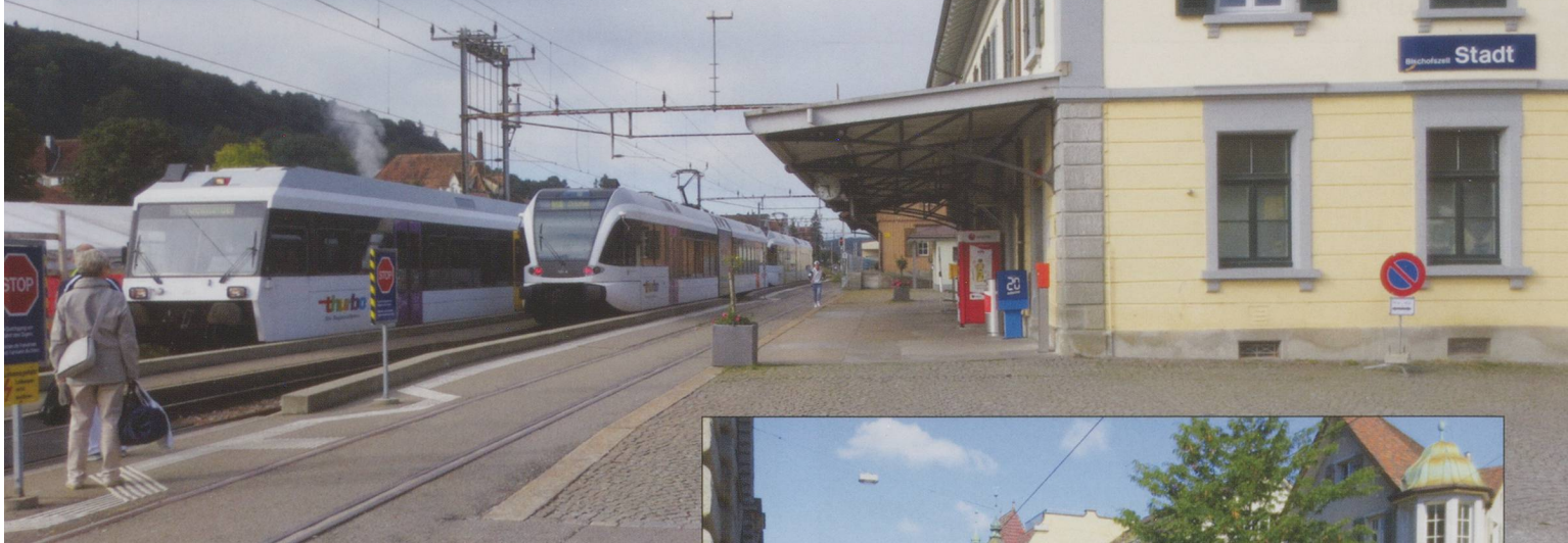
ABOVE: Trains crossing at Bischofszell Stadt. RIGHT: FWB train in the heart of Frauenfeld.