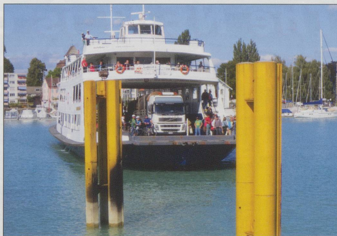
International ferry at Romanshorn.

The railway he travelled on also has its own unique history. Back in the middle of the 19thC the good citizens of Bischofszell were concerned that their small town would miss out on the railway revolution, as main lines were opened through Weinfelden to Romanshorn to the north, and Wil to St Gallen to the south, both in the 1850s. As the major companies would not connect them to the growing network they formed the Bischofszellbahn to build the 23km line connecting Sulgen on the northern line to Gossau on the southern, and mortgaged one-third of the community's assets to fund the scheme. The line was opened in two stages in