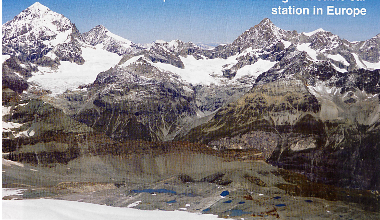
The magnificent view from Klein Matterhorn.

David & Elizabeth Carpenter travel to the highest cable car station in Europe