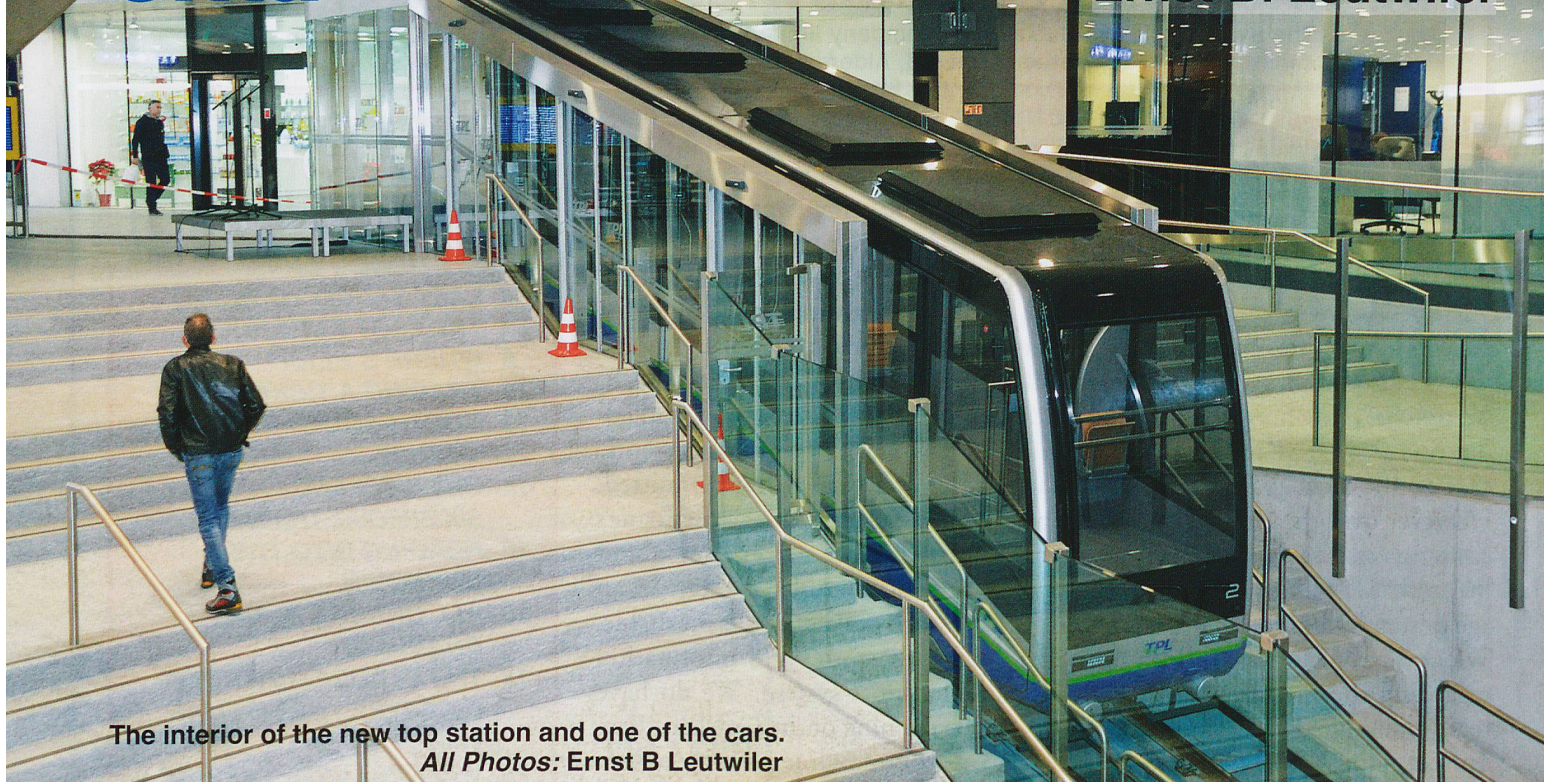
The interior of the new top station and one of the cars.

When the main line railway from the north to Italy via the Gotthard tunnel, arrived at Lugano in 1882 the site of the station was 53m above the old town leaving residents and visitors to this increasingly popular resort, with an arduous route between the two areas. Increasingly pressure mounted from influential people who determined that a more commodious link should be established. At the end of 1884 the well-known pioneers of mountain railways Bucher & Durrer obtained a concession to construct a 220m long, metre-gauge funicular on a gradient of 25.3% to link the city to its station. Once the project commenced in April 1886 progress was swift, and following an inspection in the October operations started on