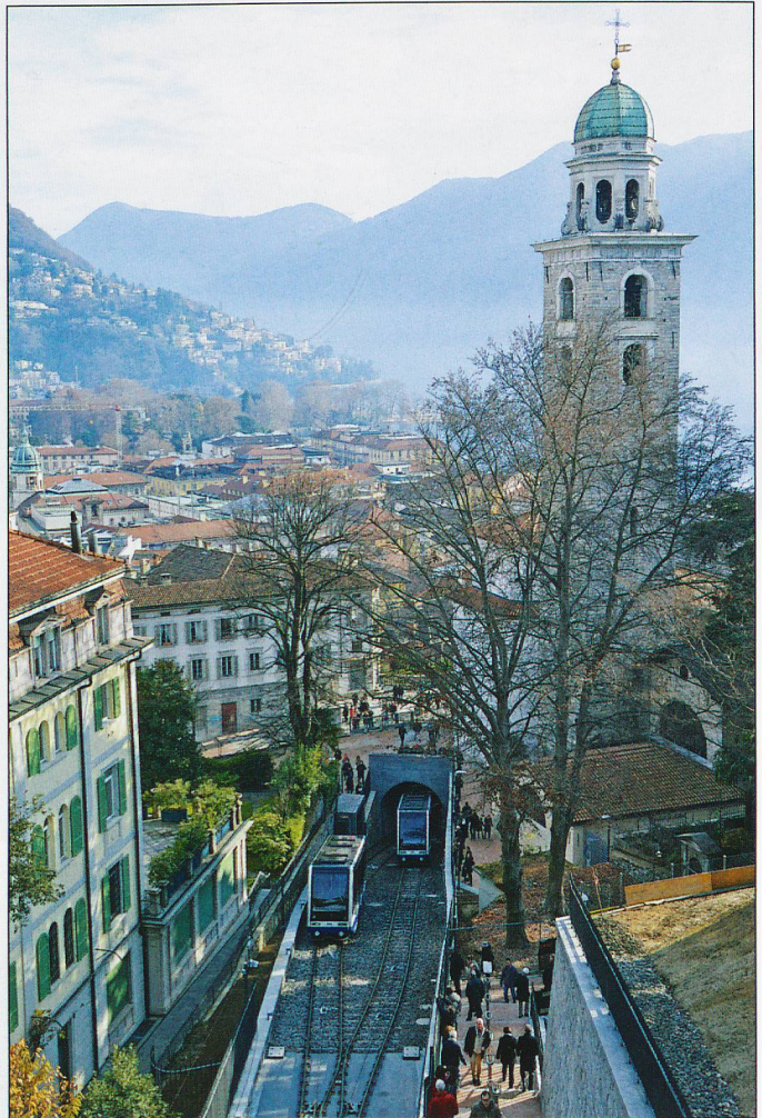
TOP: Crowds at the top station for the opening of the new funicular. MIDDLE: The view looking over Lugano. LEFT: Work in progress on the middle cross-over section. BOTTOM: The interior of one of the new cars.