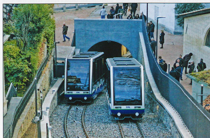
The renewed Lugano city funicular on its first day back in service. The cars are stopped whilst No. 2 on the left serves the halt at the cathedral. 11th December 2016.

The new facility has some 35% more capacity than the old system and at peak times can carry 2,240 passengers/hour. At the same time as the funicular was being rebuilt the SBB/FFS undertook a major reconstruction of the main station, and this too reopened on the 11th December. See the article on P. 2 of this magazine for more details.