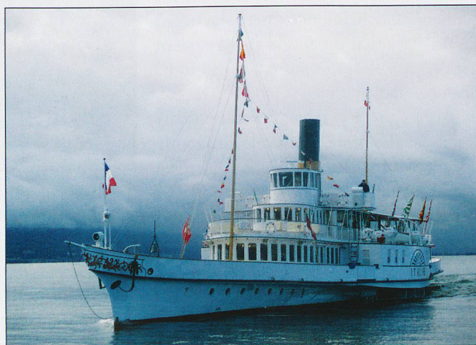
p/s Italie at Lausanne-Ouchy on the 11th November.

Built by Sulzer in Winterthur in 1908, and re-engined in 1955, this classic ship from the Belle Epoque era has been out of service over recent years. Following a rebuild in the shipyard of the CGN, that also involved replacement engines, she re-entered service over the weekend of the 10th/11th November.