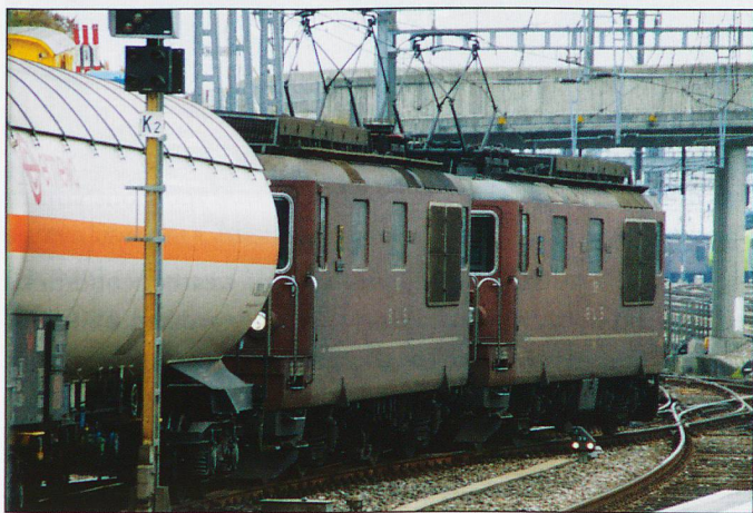
BLS Re 4/4s 177 and 175 pass through Spiez on a freight.

● Spiez - This centre of BLS operations is always worth a visit. A lunchtime hour in October produced the usual succession of trains, including a dozen or more BLS Re 4/4s (Brüneli/Brownies), several blue Class 465s, and a succession of intermodal block trains. In addition Vectron No.475 403 was on test, and a complete surprise was the new SBB Intercity unit RABe 502 203 running trials on the BLS Base Tunnel line.