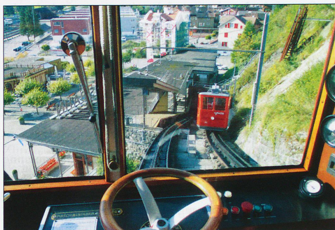
Most of the station at Alpnachstad is still in the original state.

We have reported in the past on the long-running saga of the Waldenburgerbahn that has resulted in it becoming a part of Baselland's BLT organisation, and on work commencing on its modernisation and conversion from its unique 750mm gauge to conventional metre-gauge operation. During the implementation of this project, which is scheduled for completion by 2022, it is intended that the potential for future full-automatic driverless operation of this line will be considered as an integral part of the programme. In Eastern Switzerland the management of the SOB are also studying the possibility of introducing a pilot project involving driverless trains in the next few years. The Editor recalls that back in 2012 when he was a guest in the cab of one of the RhB's then-new Allegra units on a run from Chur to Arosa, the driver commented that once clear of the section shared with road traffic in Chur, the EMU's on-board computer could drive the train to its destination with no involvement from him. It is understood that in Germany DB are also looking into trials of driverless operations.