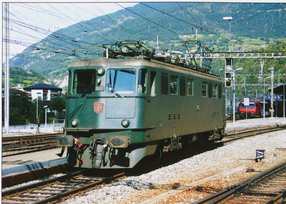
11487 'Langenthal', leaves Brig station prior to taking out the afternoon westbound pick-up goods, 08/08/06.