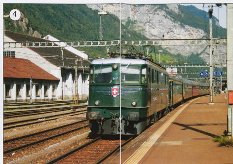
3. 610482 'Delemont' returns to Erstfeld, light engine, prior to taking up her next duties, 18/09/09. 4. No.11407 'Aargau' heads a Schaffhausen - Chiasso charter through Erstfeld. Classmate No.11402 "Uri" can just be seen in the far distance, 03/09/11. 5. No.11431 'Sarnen' stands at the end of a row of no less than 21 class Ae 6/6s at Biasca - all of which were bound for the cutter's torch, 22/06/10. 6. Cantonlok No.11404 'Luzern' passes through Pratteln on the Brugg lines with a mixed freight, 27/06/08. 7. Immaculate 610439 in Cargo livery complete with 'Schaffhausen' nameplates, hauls a northbound container service through Pratteln, 27/06/08.