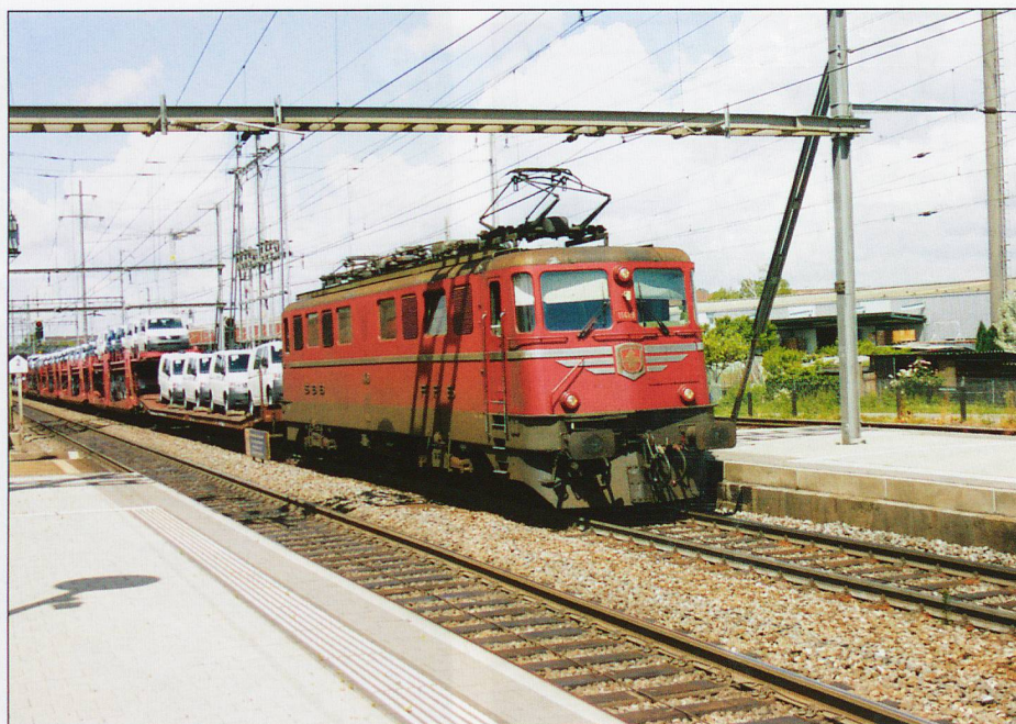
Cantonlok No.11419 'Appenzell I. RH', heads through Pratteln with a train of vans in the direction of Brugg, 27/06/08.

From 2010 onwards, as new motive power arrived in Switzerland, along with a general downturn in freight, more and more members of the class were being "switched off" and could be found stabled in sidings and yards – very few of these would escape the cutter's torch. Anyone