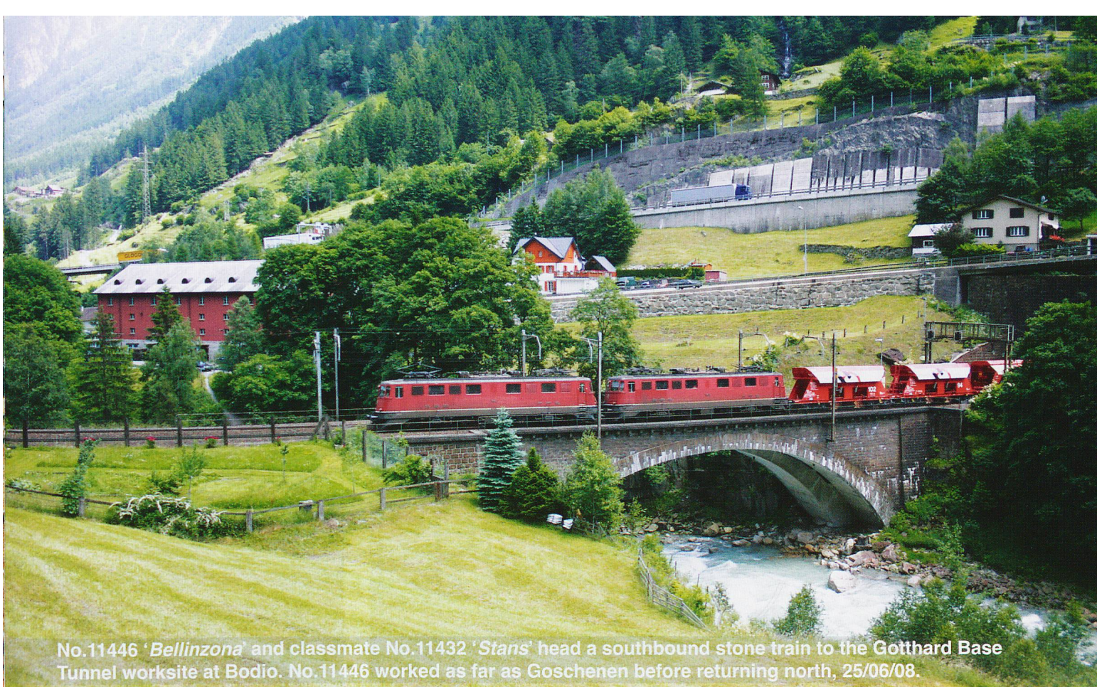
No.11446 'Bellinzona' and classmate No.11432 'Staris' head a southbound stone train to the Gotthard Base Tunnel worksite at Bodio. No.11446 worked as far as Goschenen before returning north, 25/06/08.

to be the destination of choice for many years to come. Scheduled workings for the Ae 6/6 class over the mountain route were very rare indeed, however in the summer of 2008, the construction works associated with the Gotthard Base Tunnel did produce a regular Ae 6/6 working, this being a double-headed combination working a stone train from Huntswangen-Wil to Bodio. Such workings still exist today, being in the hands of an 'Re 10/10' combination and serving the Ceneri Tunnel worksite.