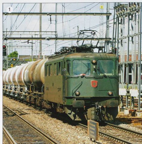
1. No.11427 'Stadt Bern' leads a train of cement tanks out of Basel Muttentz yard, 27/06/08. 2. No.11465 'Oerlikon' approaches Killwangen-Spreitenbach with a mixed goods bound for Zurich Limmattal yard, 25/06/10.

at Erstfeld has on occasions been hired out for banking duties over the Gotthard North ramp, with enthusiasts being invited to "ride the footplate" at considerable cost! It is still possible to see the remaining seven active members in service throughout Switzerland, as they are often called upon to work charter trains. Hopefully this article has been an enjoyable read, and hopefully it will inspire others to share their memories of these iconic locomotives - you have 50 years worth of material untouched! 🇨🇭