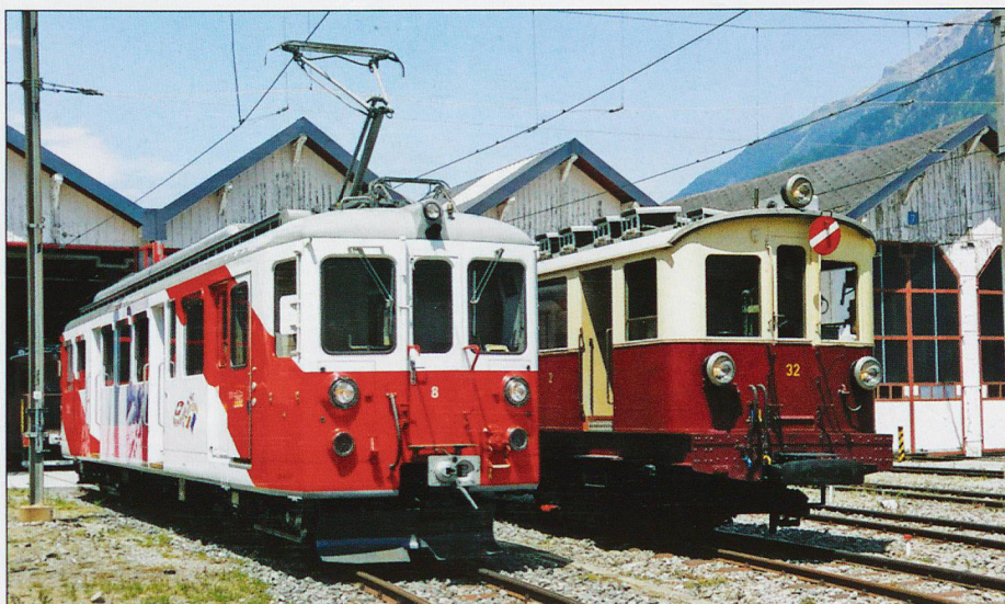
LEFT: All 4 vehicles outside the shed. TOP: MC No 21 and BDCh 4/4 No. 32. RIGHT: Old and new BDCh 4/4s on display.