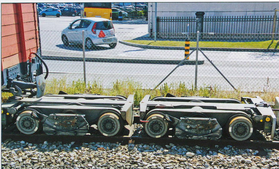
Transporter bogies in the siding at Yverdon.

A new Stadler Abe 8/12 unit waits at Ste-Croix to return back down the line.