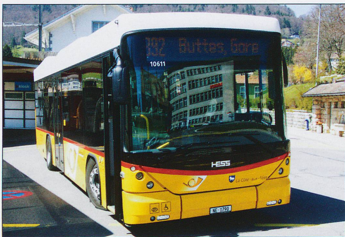
The connecting bus to Buttes waits outside Ste-Croix station.

decided upon. The YStC had no debts but the capital outlay for this change was beyond it. Grants of CHF400,000 came from public funds, and a loan of CHF1,200,000 was secured from the Confederation and Canton Vaud. A new share issue of CHF2,880,000 was made, taken up mainly by the public administration. Electrification of the line to the Swiss standard of 15kV 16.7Hz was then completed in 1945, and journey time fell below an hour.