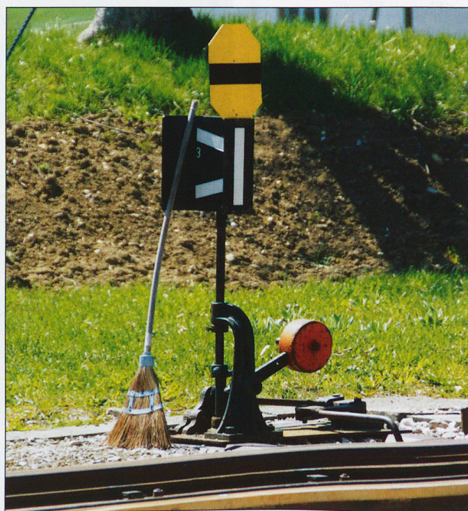
A point lever and winter essential broom at Ste-Croix.

s'Murmeli (The Marmot in Swiss-German) is a Swiss Railwayman.