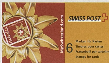
Exclusive stamps from the Swiss post office.