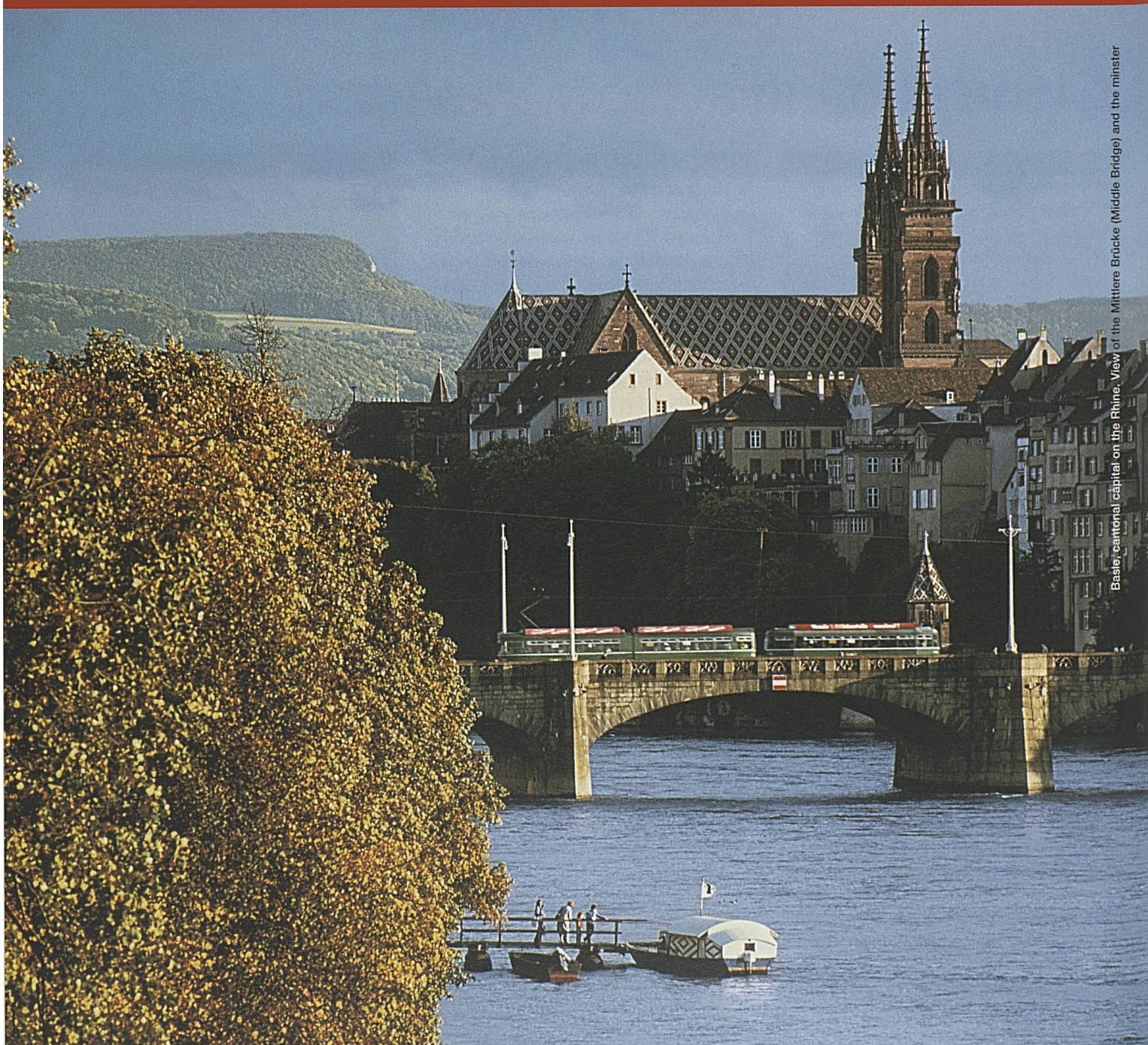
Basel, cantonal capital on the Rhine. View of the Mittlere Brücke (Middle Bridge) and the minster

Alliances between Switzerland Tourism, regions, destinations and service providers have raised the profile and efficiency of the products on offer and the marketing thereof. Which makes Switzerland Tourism even more attractive for business partners.