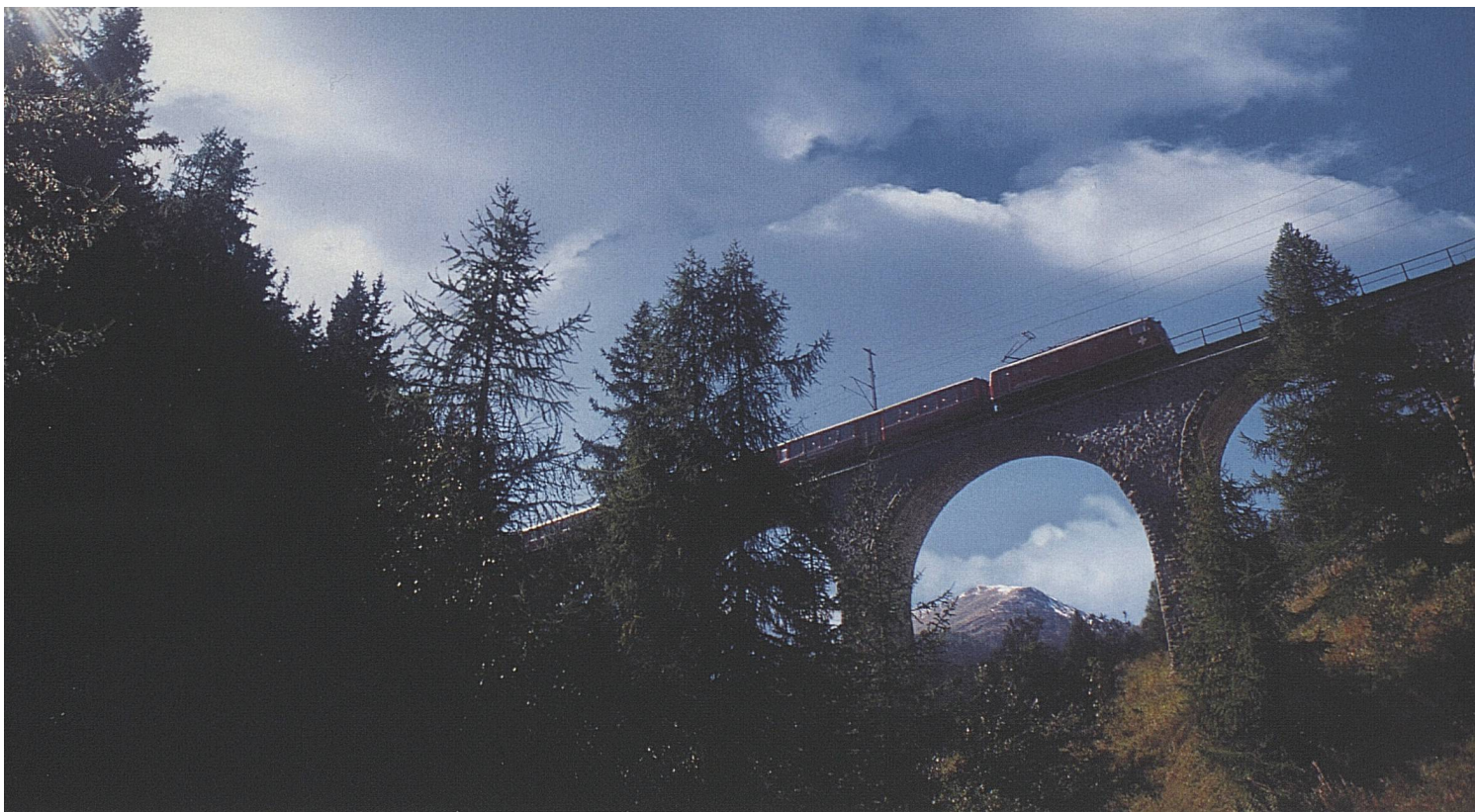
The Rhaetian Railroad.