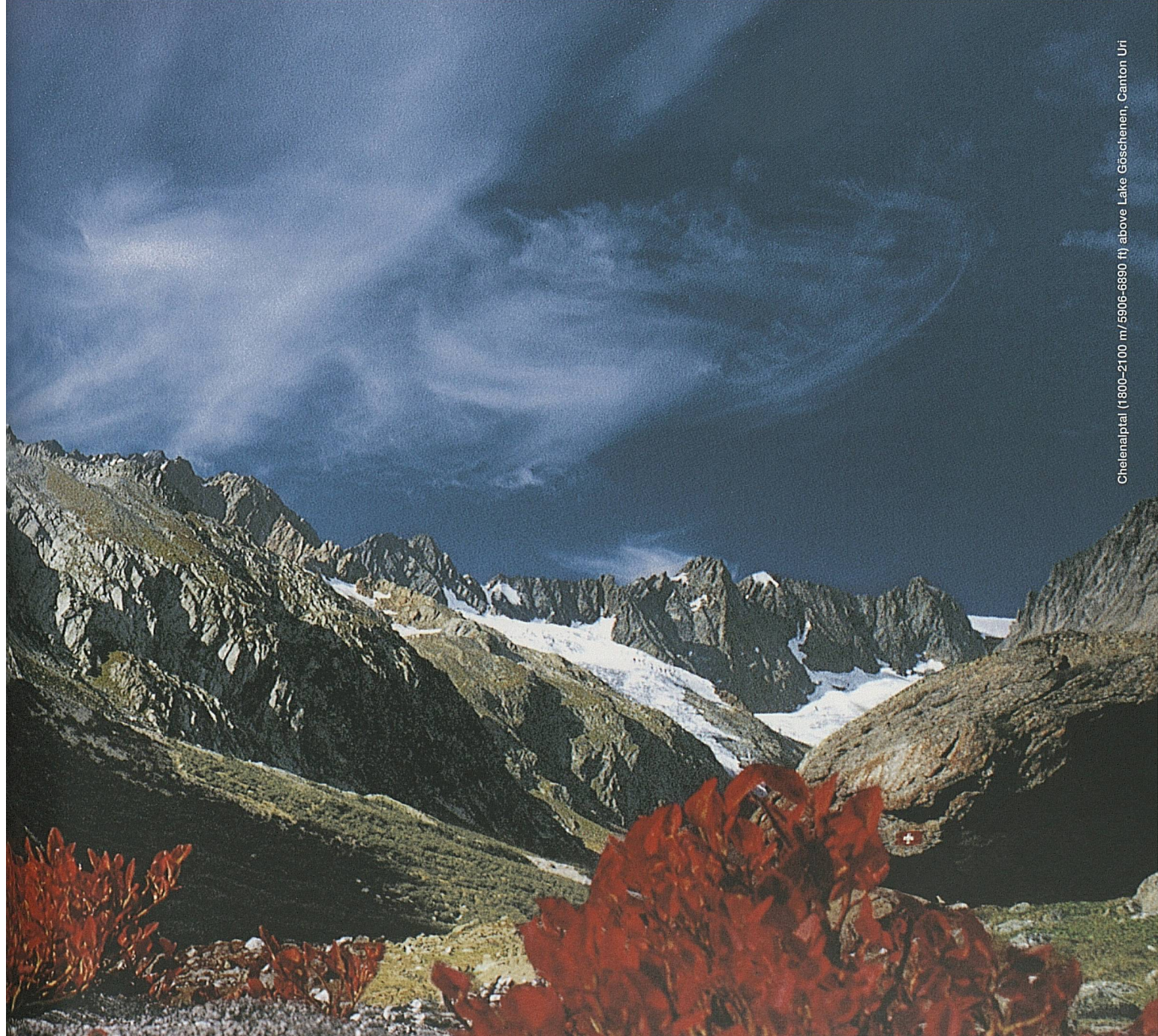
Chelinalptal (1800–2100 m / 5906–6890 ft) above Lake Göschenen, Canton Uri