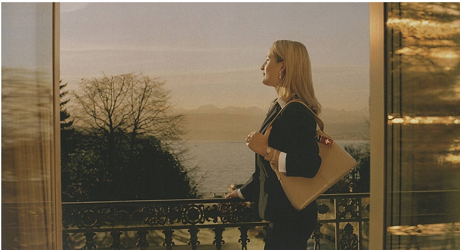
Central motif of the "Luxury & Design" campaign.