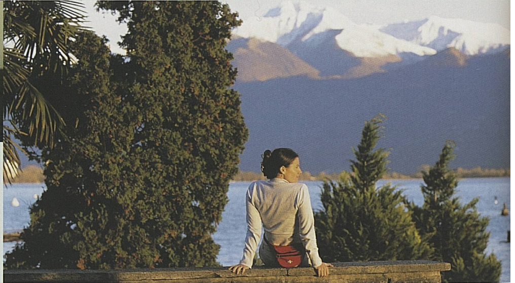
Locarno by Lake Maggiore, Ticino.