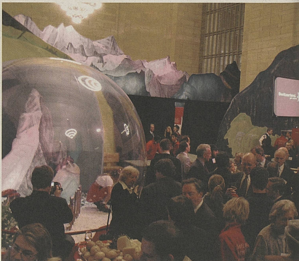
The miniature Switzerland was impossible to miss. Commuters could feel it, smell it, hear it – and buy it.

The media response was overwhelming. From the "New York Times" to the "Wall Street Journal", Switzerland was omnipresent, while the electronic media reported in depth from Central Station. A correspondingly large number of New Yorkers went to see the spectacle for themselves. The event can be adjudged a great success.