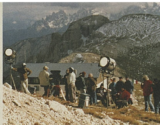
Indian film crews love Switzerland. The feeling is mutual.

To counter the cut-price offers of other holiday countries, Switzerland Tourism is courting the favours of producers from Bollywood, Mollywood and other Indian filmmaking strongholds with its "Switzerland for Movie Stars." guide. It contains all the information required to plan a film shoot, from how to obtain visas and locate hotels offering package deals for film crews to where to find Indian food caterers. With the help of the Swiss consulate in Mumbai, Switzerland Tourism also began developing valuable contacts and networking with film producers.