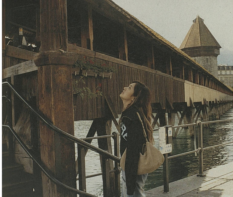
Nara Jang was impressed by historical structures such as the Kapell Bridge in Lucerne. In the Switzerland brochure the actress reveals what she enjoyed most about her visit.