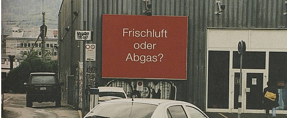
Using a teaser campaign run in Switzerland and southern Germany in summer ...