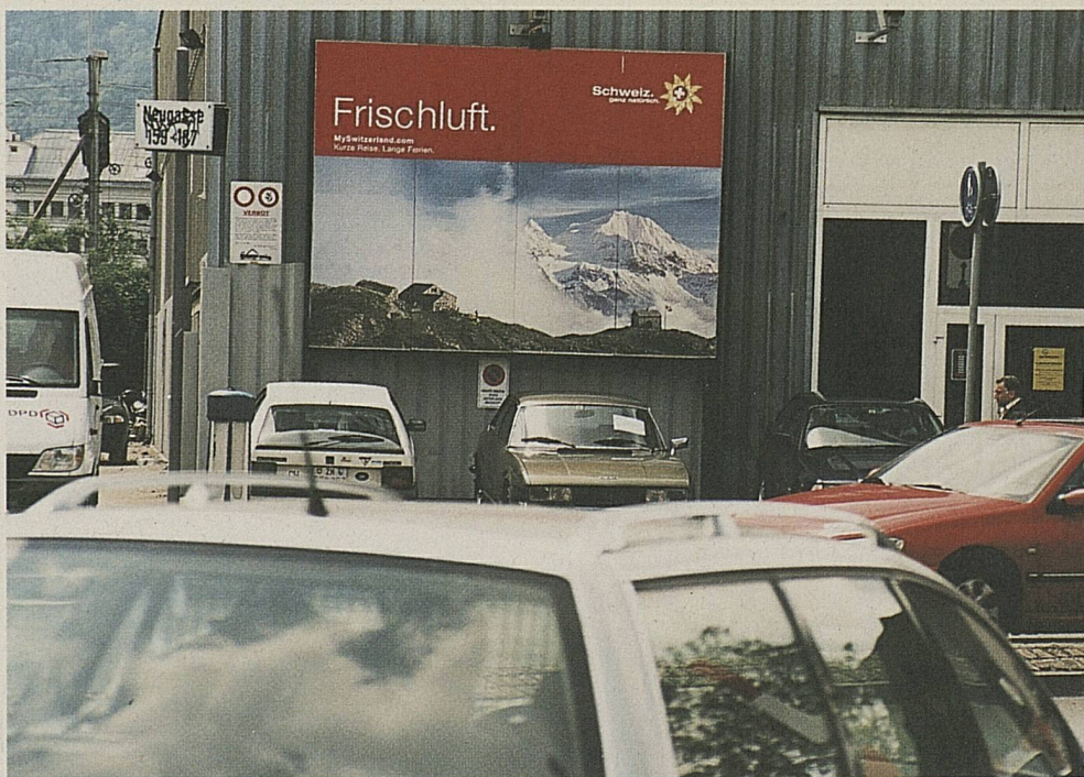
... Switzerland Tourism promoted holidays in the fresh air.

Despite difficult underlying conditions Switzerland Tourism opted for a forward strategy and thus an extensive summer campaign. This also included a review of the campaign by the Dichter Institute, which awarded the posters much better marks than the adverts. The conclusion drawn in the context of Switzerland Tourism was that adverts in newspapers and magazines make sense only in association with a specific offering, and posters only as image advertising.