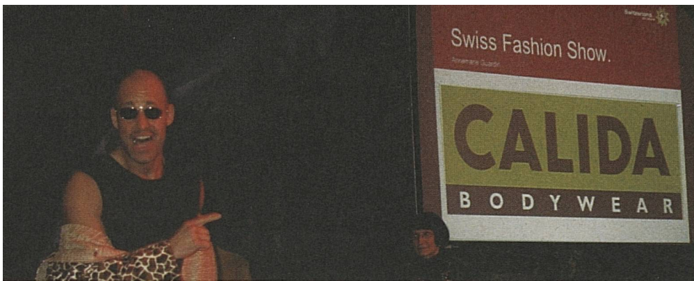
A relaxed party mood prevailed at the opening Swiss-Peaks event in New York.