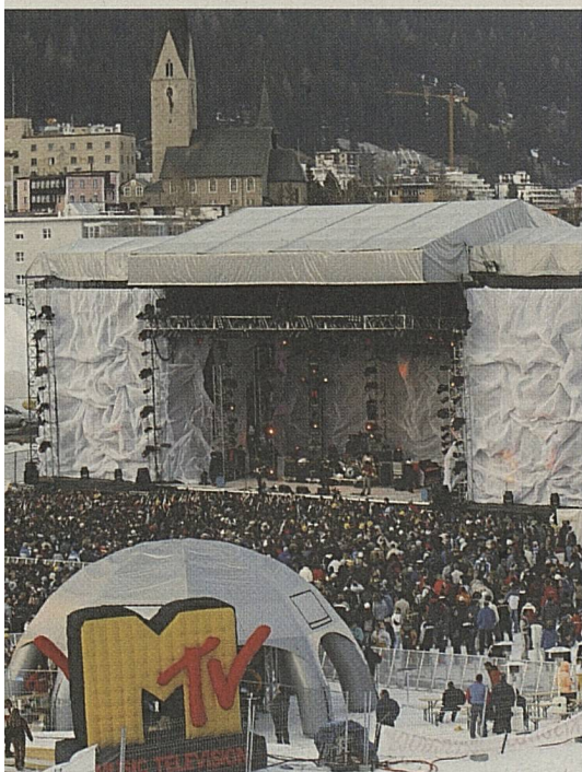
During the Winterjam Davos rocked to the rhythm of MTV.