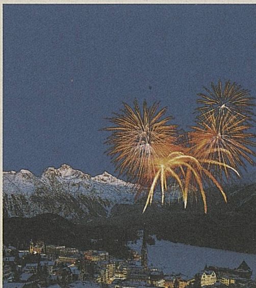
Switzerland enjoys a noble image in Russia.